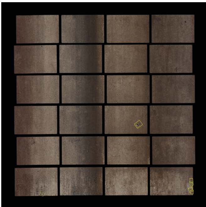
Results screen 'Defects': Each defect type is given a different colour coding.