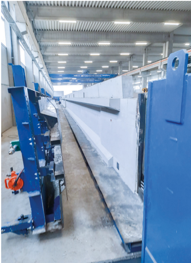
The extremely adjustable mould for I beams is 32 meters long and can produce high quality beams for medium and large industrial buildings.