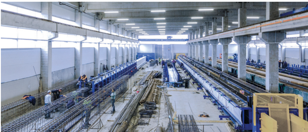
The various moulds installed are between 32 and 62 meters long.

The decision to automate has proven to be essential for GBS Prefab. Automated processes enable rapid, simple, and safe workflows for the production of the precast elements. "Maxi-