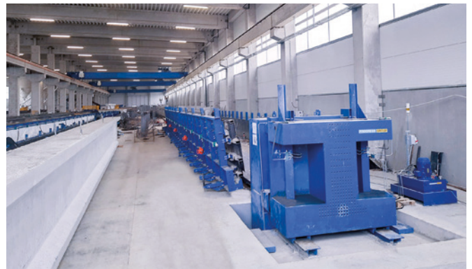
The mould for beams with abutments makes it easier to produce exactly according to the needs of the customer.

environmentally friendly construction practices and places a special emphasis on recycling construction and demolition waste and using green and sustainable construction materials. GBS Prefab is one of the first precast plants in Bulgaria to collect and assess environmental data through a certified life cycle analysis process, providing Environmental Product Declarations for the entire production range. These measures underscore the company's commitment to responsible and forward-looking construction and are made possible with the newly installed machinery.