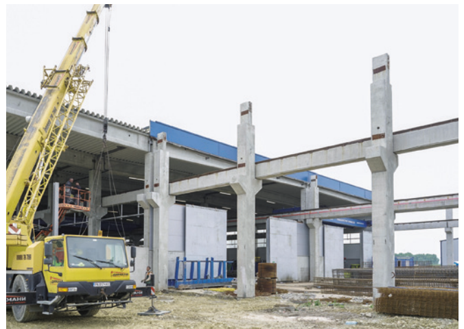
Within a short amount of time big halls and other industrial buildings can be set up.

The collaboration with Progress Group has been a crucial factor in the success of GBS Prefab. "It was clear that to achieve our goals in the shortest possible time, we needed to partner with an established market leader. Progress Group fully