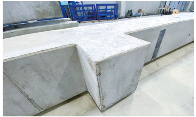
Even columns with multiple corbels on each side represent no problem for the flexible machinery at GBS Precast.