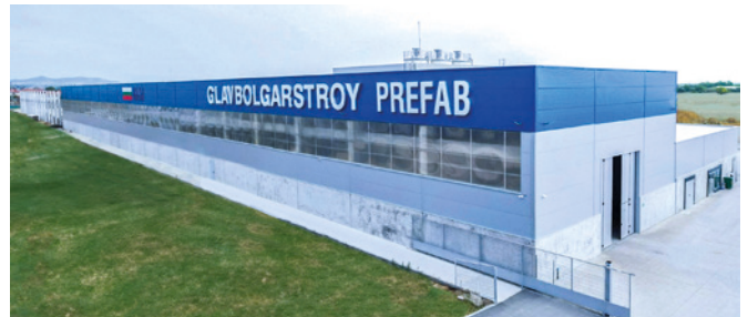
Glavbolgarstroy Prefab is part of Glavbolgarstroy Holding, a leading Bulgarian construction company and represents one of the most advanced precast plants in the country.

GBS Prefab, established in February 2022, strives to uphold the high standards set by the parent company through implementing highly automated machinery from Progress Group.