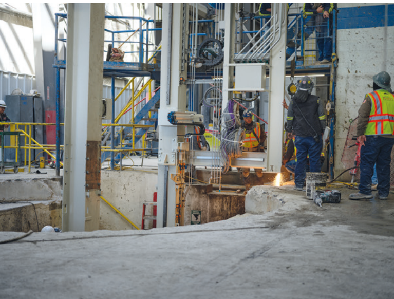
Final installation works