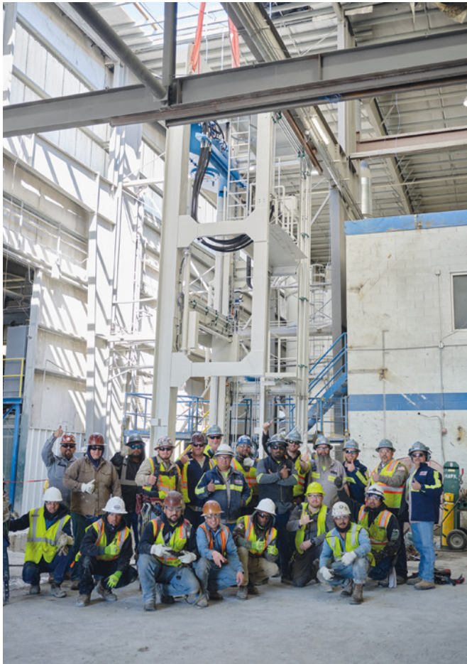
Successful Radial Press Replacement