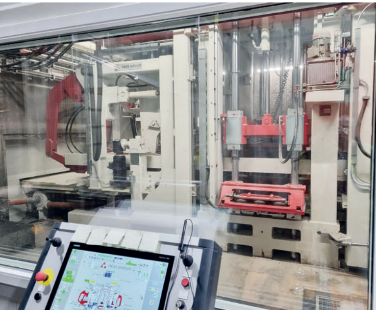
Control station & RH 2000-4 MVA (Hengelo)

ufacturing and the ability to adjust the concrete block and paver machine accordingly. However, it all begins with quality aggregates; if the combination of aggregates is not suitable, top-quality concrete products will be impossible. At Morsinkhof Groep Hengelo, all the necessary steps have been taken to ensure excellent concrete quality, and the investment in new batching plant controls has paid off.