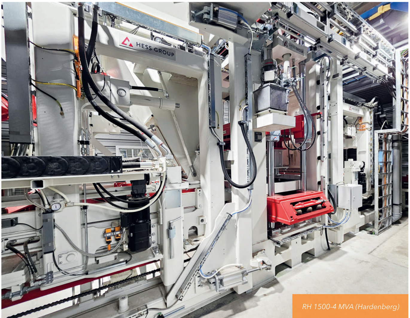
RH 1500-4 MVA (Hardenberg)