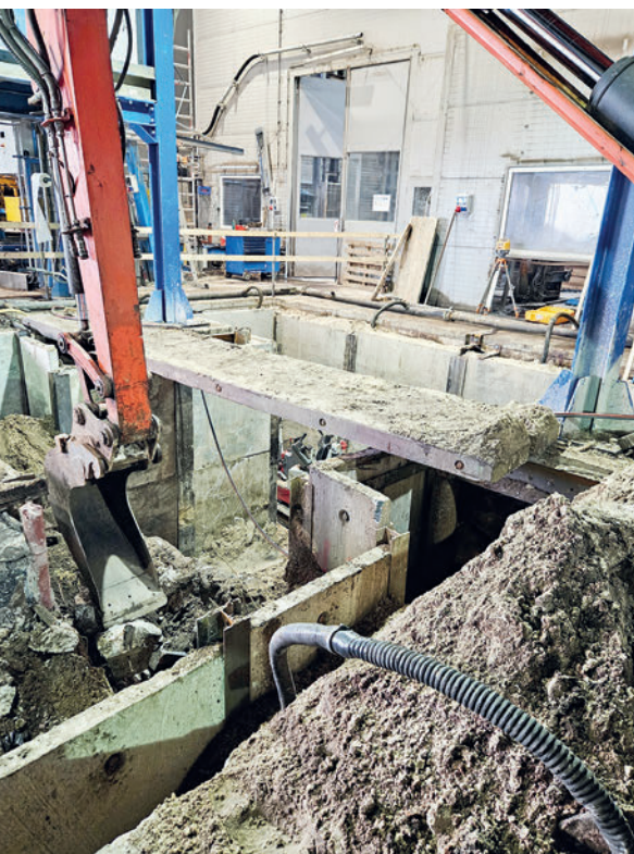
Foundation preparation (Hardenberg)

The Hardenberg project team faced numerous challenges over the complete project. The first challenge was raising the batching plant platform to accommodate the higher RH 1500-4 MVA in the available space. This project was completed in the summer of 2023. The new machine required a new foundation, presenting a challenge for the construction company. They managed to excavate a large hole for