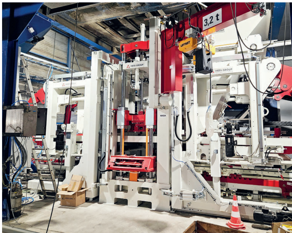
Assembly of the RH 1500-4 MVA (Hardenberg)