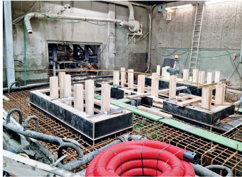
Foundation preparation (Hengelo)

Special for the Hengelo machine is the wide production area, the herring bone automatic laid paver is wider than a normal pack layer. The RH 2000-4 MVA is equipped with the driven planning roller on the face mix feed box and had to be made wider in order to get the full potential out of the planning roller system. The planning roller is now driven from only one side, the chain is mounted higher on the filler box so that the chain will not run through spilled concrete on the side of the filler box. These modifications created enough space to equip the concrete block and paver machine with a wider face mix filler box.