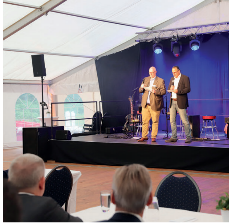
Welcoming the guests to the evening event

The affiliated companies of the Topwerk Group - SR Schindler, Prinzing Pfeiffer and Hess AAC - were also represented at the event. They demonstrated the breadth and expertise of the company's portfolio with their exhibition areas.