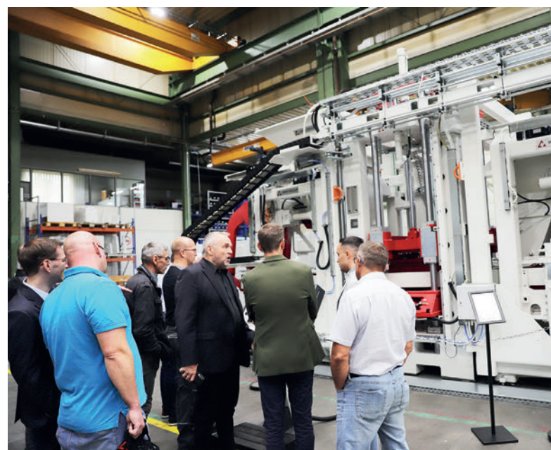
The diverse exhibition programme included machines such as the RH 2000-4