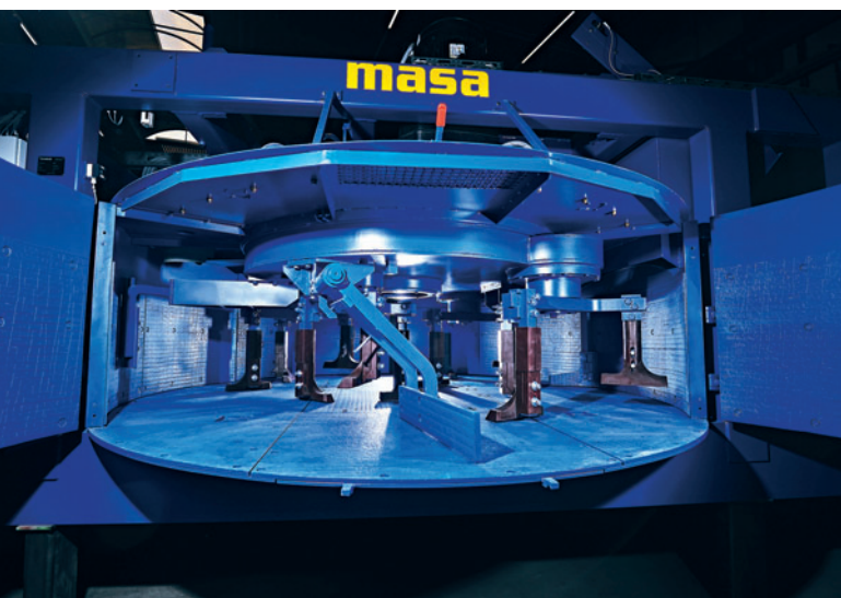
Masa PH 3000/4500

In the discussions and negotiations with various suppliers of concrete mixers, it gradually became clear that Masa is the right partner for this task. In addition to many technical refinements, the massive and solid construction of the Masa concrete mixer also played an important role in the decision: The PH 3000/4500 consists of a lower and upper frame as well as a mixing trough with two double-wing doors that open up to the floor. With a total weight of almost 25 t, it weighs considerably more than many of its competitors. The significant increase in the steel used and the fact that the planetary gear is equipped with three external 45 kW drive motors of energy efficiency class IE3 are noticeable: The Masa mixer provides a combination of short mixing cycles with low wear and tear and a very high plant availability.