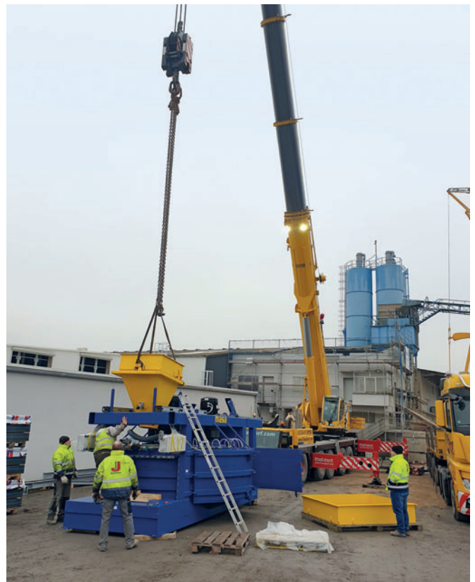
New equipment for Jasto

Jasto ensures consistently high-quality production facilities that meet a very high technical standard. Targeted expansions and modernizations of the plant in Ochtendung guarantees that Jasto stands up to all product areas with advanced technology on the market and manufactures with impressive dimensional accuracy and very high capacities. The Masa block making machine for the "Garden World" products, which came into operation in 2017, is running at full speed, as well as the Masa block making machine for wall building materials installed in 2014. In 2019, Jasto decided to modernize the facility. The aged concrete mixers should be supplemented by modern high-performance equipment that can easily and flexibly produce the entire range of required mixes.