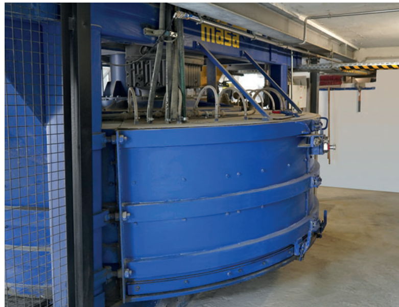
Successful installation of the new mixer

implement Jasto's ideas and concepts. The investment in the Masa PH 3000/4500 concrete mixer is already paying off: Since May 2020, the Masa block making machine has been supplied with high-quality concrete from the new mixer and produces first-class wall building materials for the Jasto company.