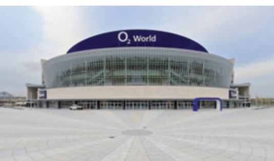
Project with large-format concrete paving slabs

The Hotshoe technology from Kobra Formen GmbH has been continuously developed and today encompasses a complete equipment package, including control technology. The basic technical outfit is completed with a once-only installation of the main connecting cable, the control and regulating equipment and the cable to the machine's tamper head. Each mould is thus controllable. Hotshoe moulds are manufactured for a specific product in accordance with the pressure plate surfaces to be heated and the \Delta T values to be achieved. Temperature sensors installed directly at the surface guarantee reliable reheating to the target temperature in each production cycle and make Hotshoe a practicable feature of mould technology.