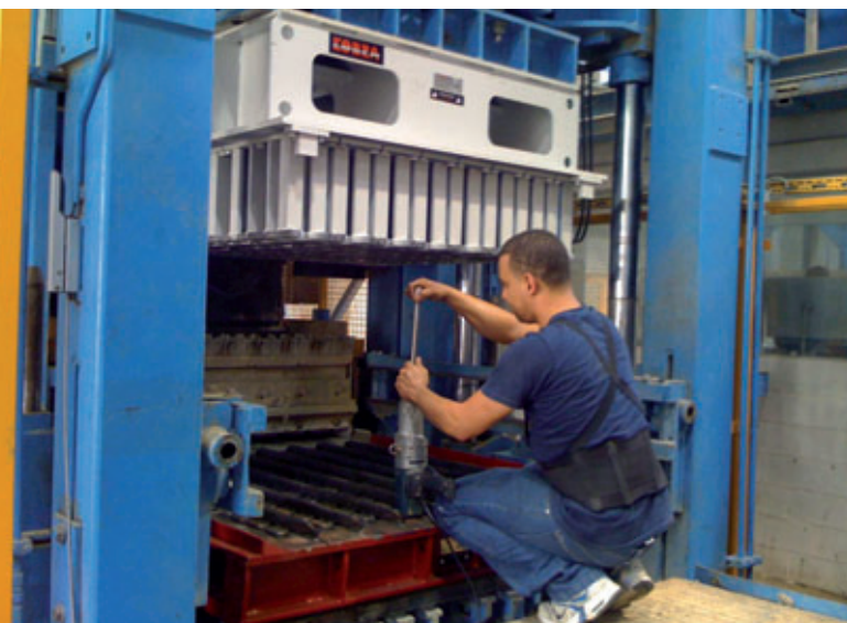
Kobra Mold installed and ready for production

Still, F.O. soldiered on. As the demand for their products continued, in 2008 the company pulled the trigger on a completely automated Masa 9002 XL fully automated plant that can produce 100,000 to 115,000 blocks/day. In total, F.O. has the