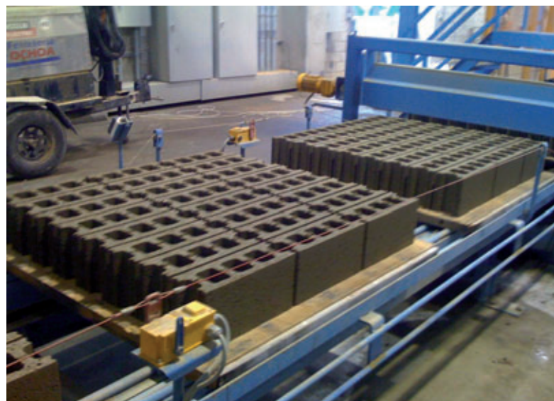
6 inch 3 cored block during production