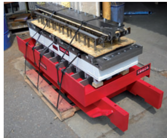
Kobra Mold for Besser SuperPac machine ready for shipment to Ferreteria Ochoa

pany design alternative versions of the current blocks they produce. Further, F.O. enjoys full access to Kobra's design team as well as the manufacturing facilities located in Lengenfeld, Germany and Hudson, Wisconsin.