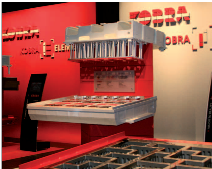
The hollow block mould 'Project "ITG™"' at the Bauma 2007

The mould insert itself is integrated in the mould bottom in a circumferential special elastomer frame and promises outstanding properties in compacting and handling.