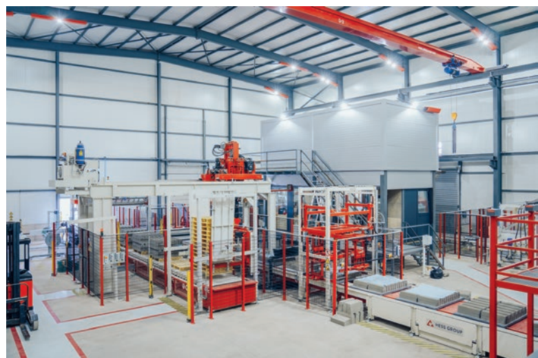
In defined cycles, the boards move beneath the block and paver splitter, which precisely pushes products together and aligns them for downstream processes.