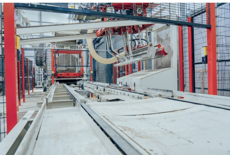
On the wet side, products pass through the washing unit.

The hydraulic control pump adapts dynamically to real power requirements, reducing energy consumption and providing smoother machine movements. Depending on mix design and machine settings, cycle times of 11.5 seconds are achievable – equivalent to up to 2,110 m 2 of face-mix paver or 20.520 CMUs per 8-hour shift. The robust MAC 8 control system ensures stability and precision across all process stages. The downstream handling system is designed for efficiency