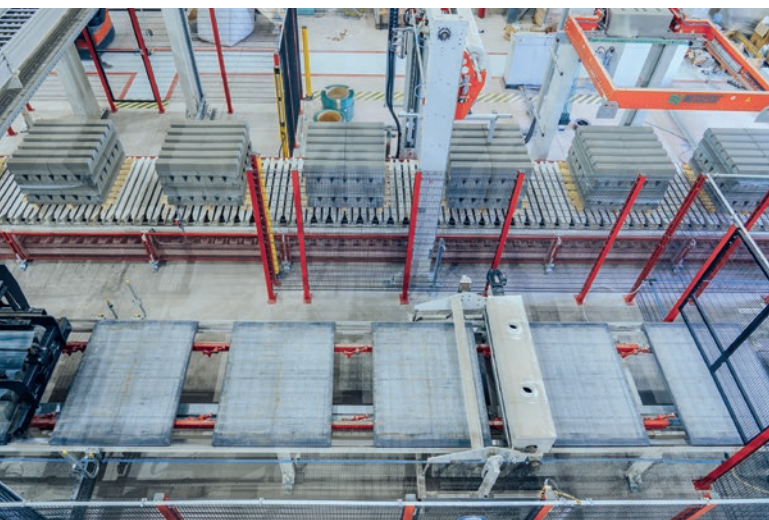
The empty production boards move automatically beneath the cuber and pass the cleaning station.

The plant in Plovdiv sends a strong technological signal. The combination of a modern batching and mixing plant, a high performance RH 1500-4 MVA, continuous automation, and data-based process control creates a production platform that will shape the Bulgarian block and paver industry for years to come. Flexible project execution, ongoing technical advancement, and Persenk Invest's clear innovation strategy underscore the company's focus: quality, growth, and technological leadership—today and in the future. ■