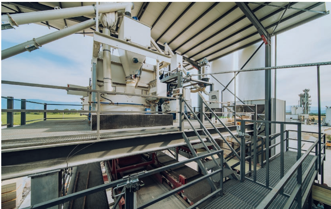
SM 3375 core concrete mixer

The project's journey began well before technical execution. At bauma 2019, Persenk Invest initiated contact with the Hess Group and outlined the idea of establishing its own block