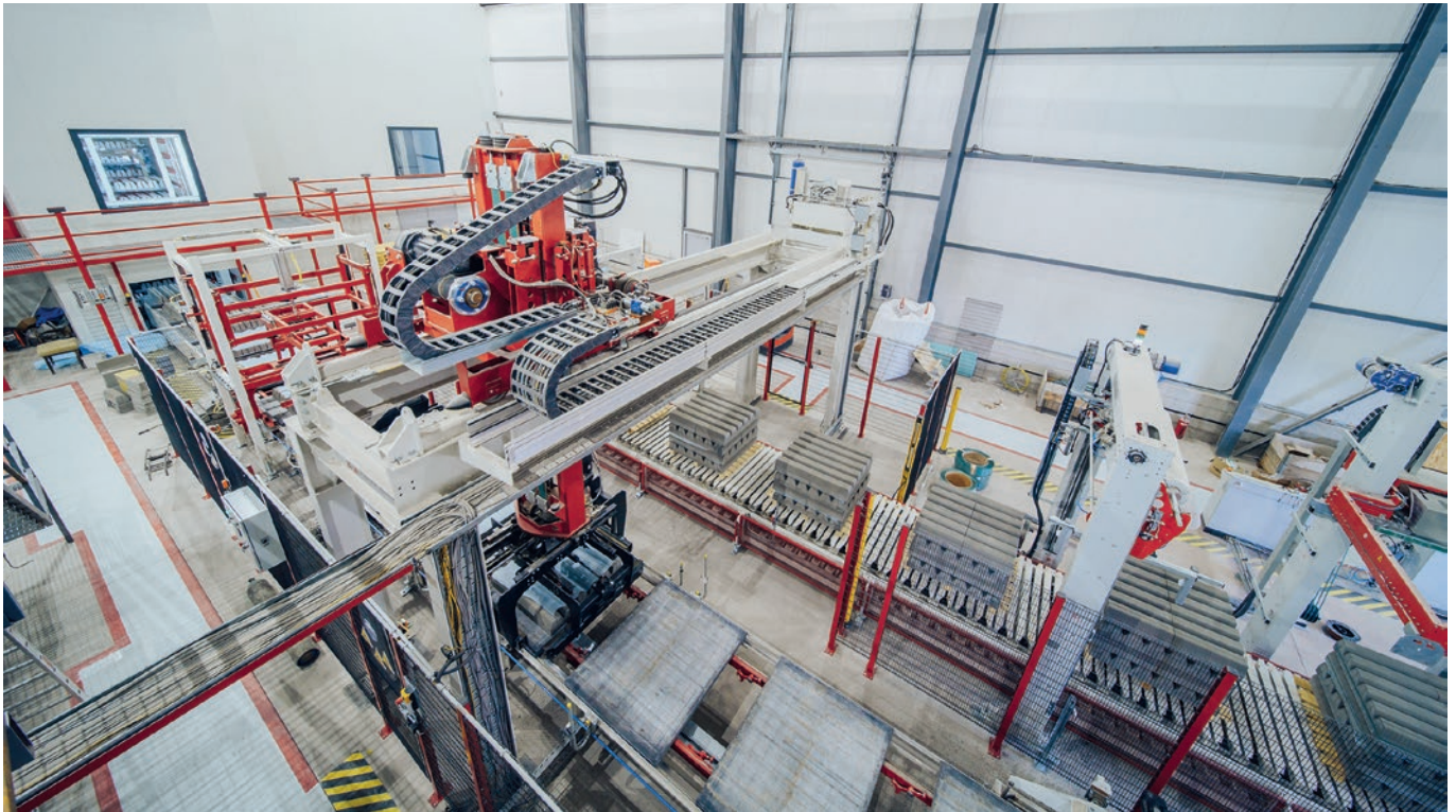
The layers move under the cuber where they are picked up, aligned, and placed on the outfeed frame conveyor.

modular, future oriented expandability of the system. High spare part availability and proximity to the Hess service network additionally strengthen long term operational stability. The company's next steps are already defined. Persenk Invest plans to expand the facility with an optical quality control system. Together with Hess, the company has already visited a reference installation in Germany, and the required board tracking functionality is already implemented. Integrating this quality solution will further digitalize production and elevate quality monitoring to a new level.