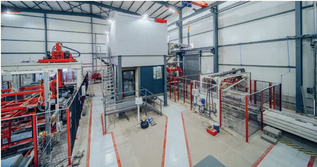
Overview of the wet and dry sides

and paver production. One year later, the Hess team traveled to Bulgaria to inspect the site and develop initial layout concepts. The pandemic caused delays, but in July 2021, the block machine was ordered, followed by the batching and mixing plant in August. Construction of the new hall began in summer 2022, commissioning took place in spring 2023, and since May 1, the facility has been producing at a high level—supplying the growing demand throughout the country.