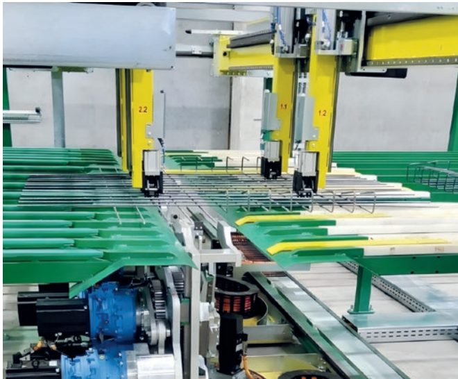
Gripper traverse and bending system for flat and bent reinforcement meshes.