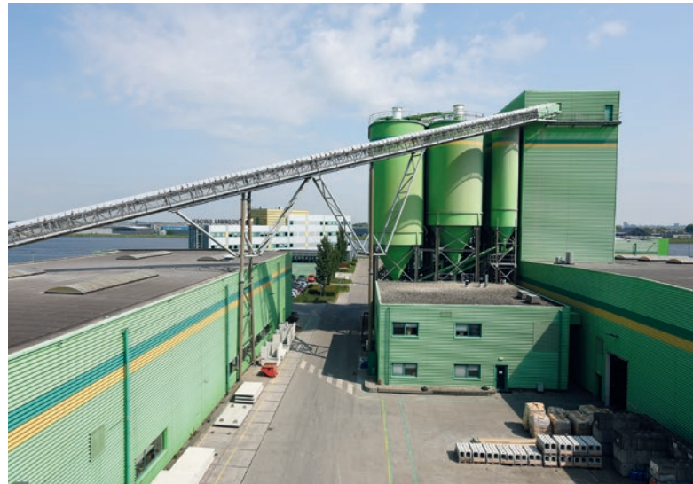
At Voorbij Prefab, sustainability and quality go hand in hand: standard concrete already meets 2030 CO 2 targets, while Impakt Beton reaches 2050 levels – already in practice.

Furthermore Vision.Image is complemented by ebos®, Progress Software Development's Manufacturing Execution System for carousel plants. ebos manages the shuttering robot, production planning, and factory output optimization – serving as the digital backbone of Voorbij's daily production.