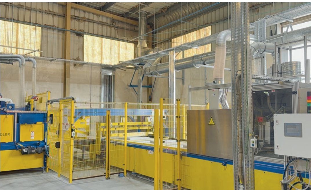
Transfer from curling to coating line