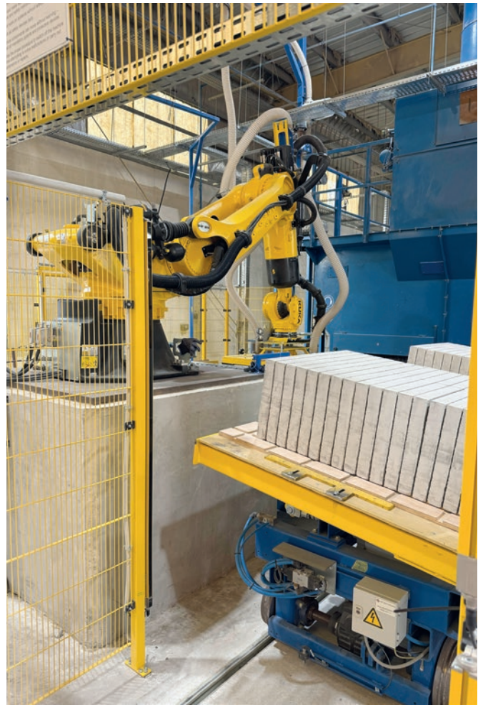
Transfer carriage system with robot loading system

Space remains for a third tunnel should Alserkal decide to expand capacity in the future.