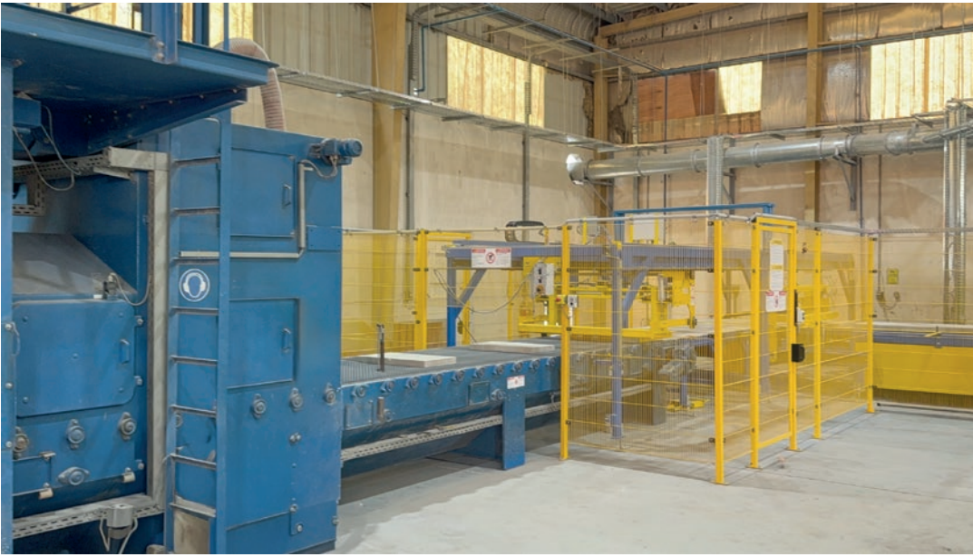
Existing shotblasting machine - provided on the construction side and integrated into the facility