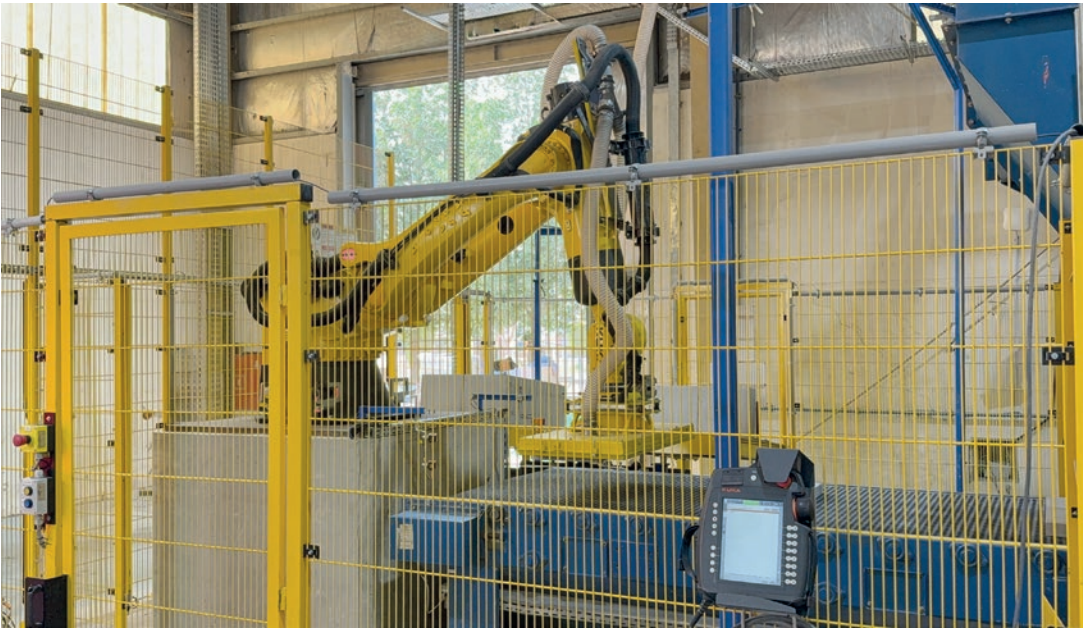
Loader robot placing products onto the shotblasting conveyor belt

Infrared heating modules manage both pre-heating and drying, while a powerful extraction system removes spray mist from the hall. Before final curing, another inspection point allows operators to replace defective pieces to maintain batch quality.