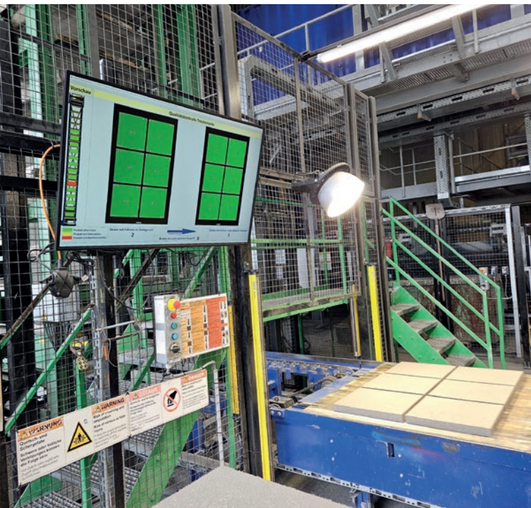
Convenient quality display with separate monitor on the dry side

Defective products are clearly colour-coded and can be replaced manually in a targeted way. This contributes significantly to increasing the delivery quality of the finished product layers or complete pallets. Masa is already working