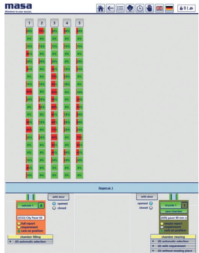
Chamber preview with visualisation of the percentage of rejects per production board

The 'Chamber preview' function gives the machine operator a quick, intuitive overview of the quality status of the products