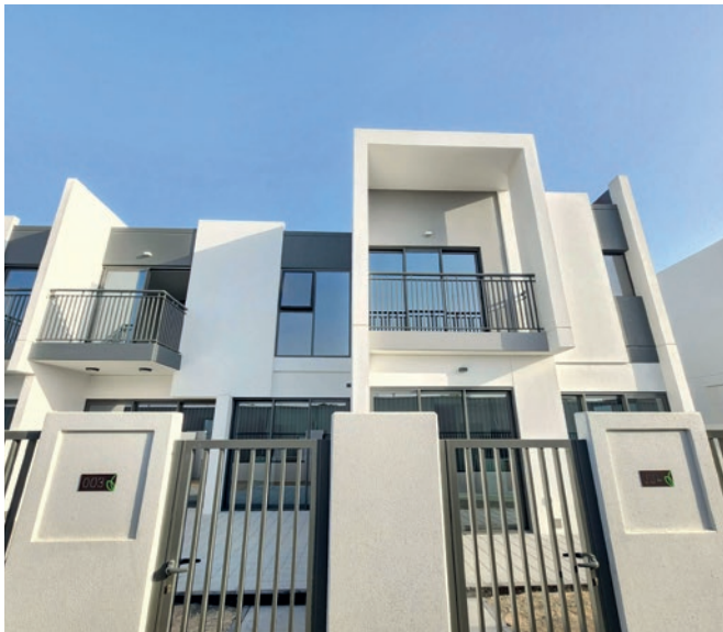
Villa Nova La Rosa, a project completed with precast wall panels.

The broader benefits of automation are hereby not only referring to cost savings. Automation allows the company to deliver consistent quality, improve reliability, and create sustainable processes. Looking ahead, Gulf Precast remains committed to leveraging advanced technology to meet the UAE's growing construction demands.