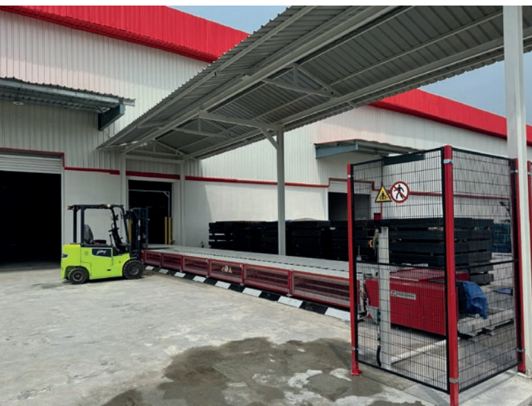
Slat conveyor for removing block packets