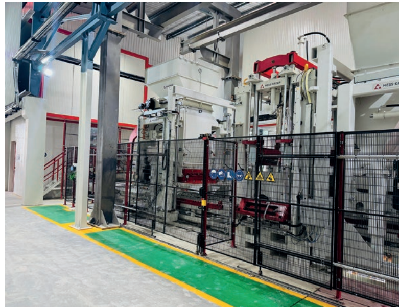
RH2000-4 VA with open facing concrete section

The machine is equipped with a variety of optional accessories to cover a wide range of products with heights from 25 mm to 500 mm. These include a polystyrene insertion unit for the production of thermally insulated hollow blocks, a facing concrete unit for the production of paving blocks with sophis-