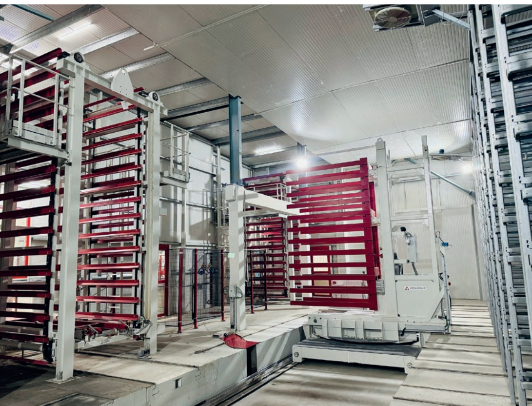
Curing with elevator and lowerator and finger car

A special feature of Mehramat Concretes is its consistently implemented zero-waste mining concept, which was developed in response to a particular challenge. In the Assam region, there is hardly any demand for fine aggregates on the local market. These fractions were previously a by-product of rock processing and were discarded as 'waste mountains' with no economic value.