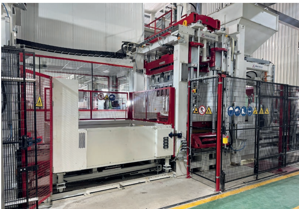
Polystyrene insertion unit

With an impressive production capacity of approximately 1,100 tonnes of aggregates per hour, Mehramat Concretes is one of the most efficient suppliers in the region. The decision