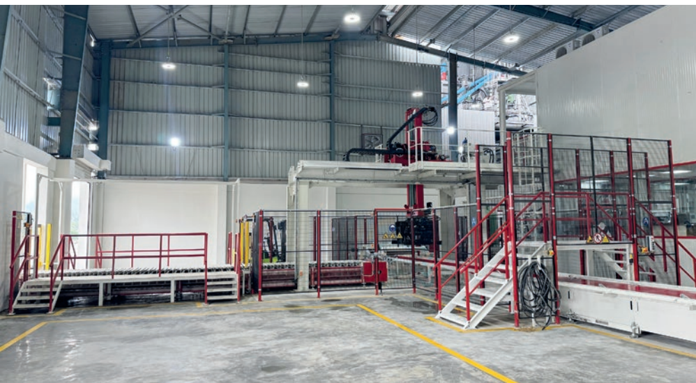
Servo 700-2 cuber with latch conveyor and slat conveyor

Mehramat Concretes approached the Hess Group with precisely this question: 'What should we do with these materials?' A solution was developed together that was technically sound and economically viable. In terms of throughput, flexibility and product quality, the RH 2000-4 VA proved to be the ideal machine for fully integrating fine aggregates into concrete block production.