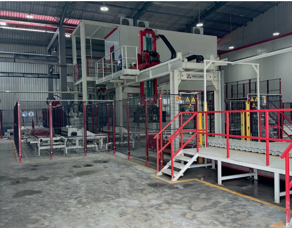
Servo 700-2 cuber