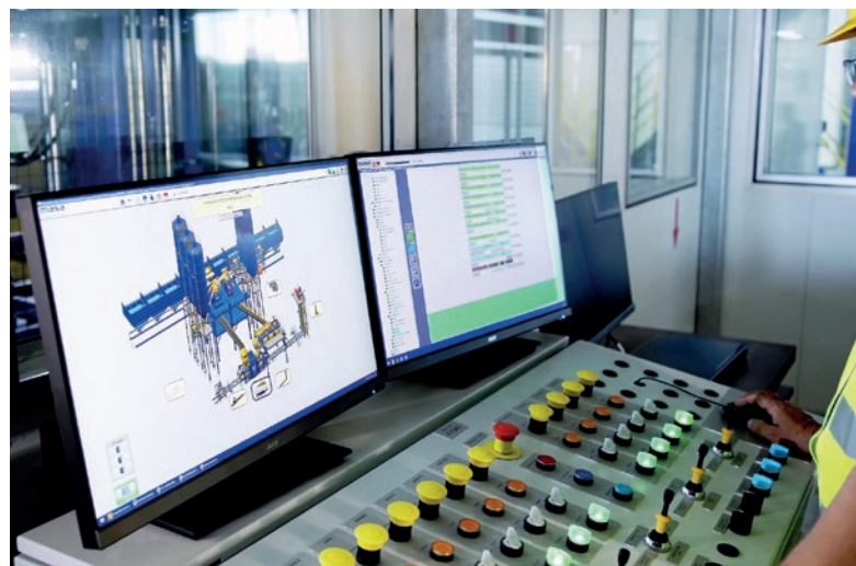
Visualisation of the production plant in the Masa plant control software.

almost simultaneously from the chamber plant. Dry side I with Cuboter I primarily ensures fast handling and accurate cubing of the uni products.