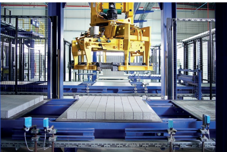
Dry side I with Cuboter: fast handling and accurate packaging of the uni products.