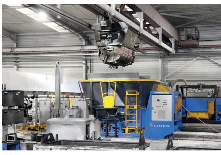
The S-Liner® slipformer ensures automatic production of prestressed concrete slabs with less cement.

The switch to the slipformer technology was a milestone: by using "zero-slump concrete", cement consumption was reduced by up to 20%, which significantly improved the carbon footprint. In addition, the curing time was reduced from 24 to 16 hours - an increase in efficiency of 30%.