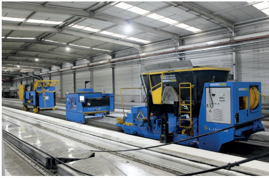
The concrete extraction machine removes the excess concrete and thus relieves the strain on employees.