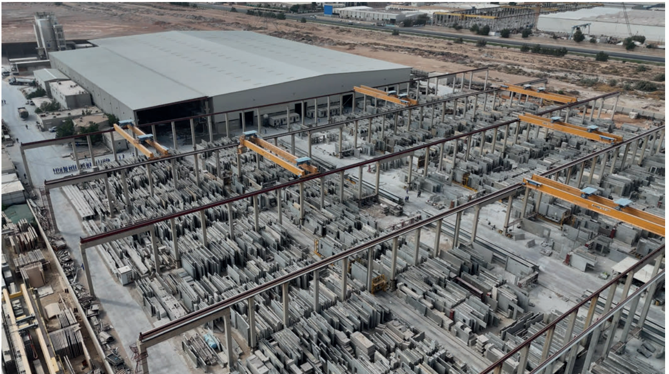
Al Rashid modernizes with reinforcement machinery from Progress Group.