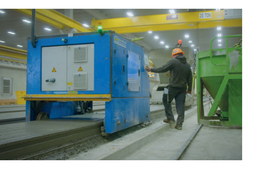
With the Automatic Plotter SmartJet it is possible to draw and print data on the precast concrete elements.