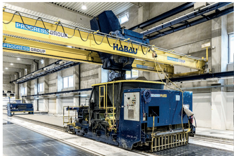
Thanks to its specific design and the use of earth-moist concrete, the S-Liner® slipformer is considered cost-efficient, easy to operate and easy to maintain.