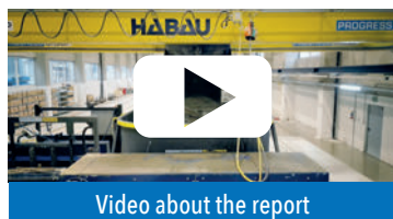
Video about the report