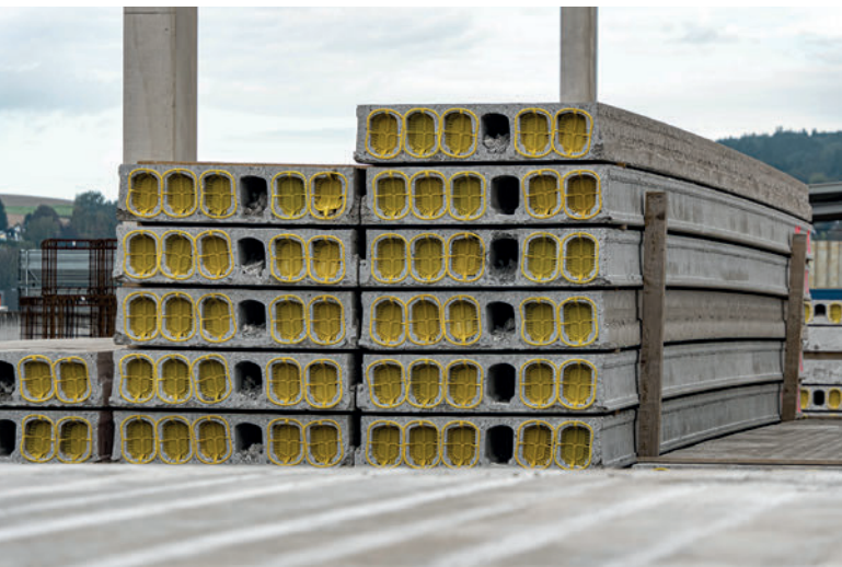
Mainly large-scale projects such as furniture markets and logistics centres are built with the elements from the Perg plant.

plants, coupled with the positive experiences and the existing trust in the Progress Group, were therefore decisive for the choice of a suitable technology supplier.