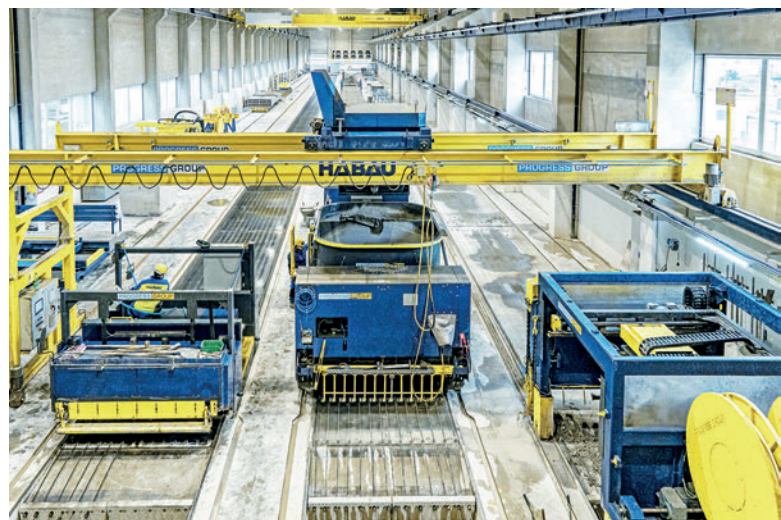
The 2.40 metre wide lines make a wide variety of products possible - for example, two 1.20 metre wide slabs can be produced in parallel on one line.