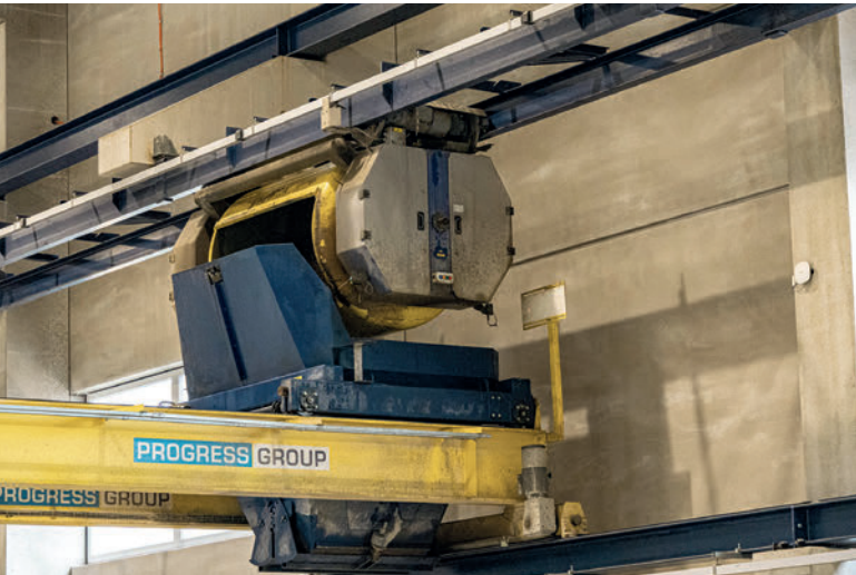
The concrete spreader with bridge is designed for the automatic supply of fresh concrete via a bucket conveyor.