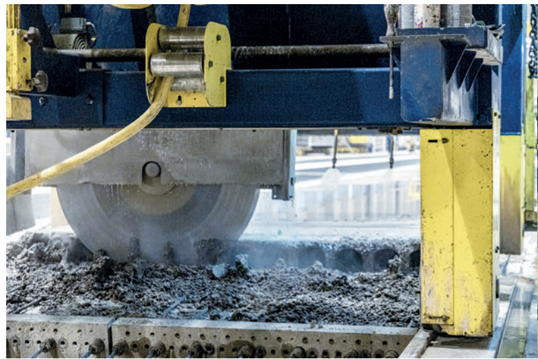
The rail-guided sawing machine produces clean, precise cuts in hardened concrete elements and fresh concrete.