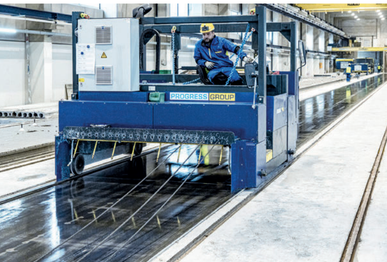
The battery-powered multifunctional trolley is used to set up a (new) line: for cleaning, oiling and pulling the strands/wires.