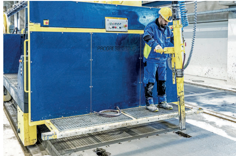
The concrete extraction machine is primarily used to remove concrete from recesses and openings.