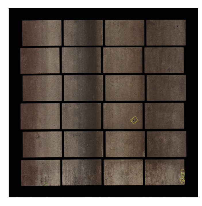
Results screen 'Defects': Each defect type is given a different colour coding.