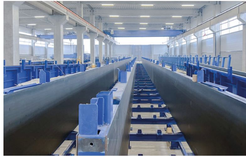
The moulds provide a high surface quality and a quick production of column precast elements.

workflows for the production of the precast elements. "Maximum productivity per unit of plant area can only be achieved with compact, modular, and easy-to-operate equipment." explains Dikov. The aim is to produce high quality elements for the industrial construction.