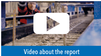
Video about the report