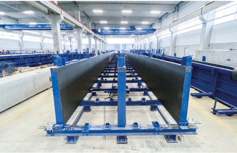
With the battery mould for columns, very high productivity per unit of plant area can be achieved.