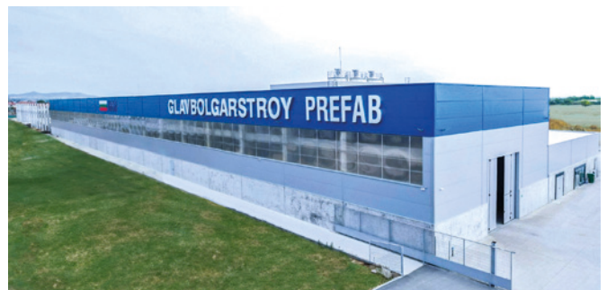
Glavbolgarstroy Prefab is part of Glavbolgarstroy Holding, a leading Bulgarian construction company and represents one of the most advanced precast plants in the country.

GBS Prefab, established in February 2022, strives to uphold the high standards set by the parent company through implementing highly automated machinery from Progress Group.