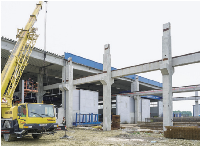
Within a short amount of time big halls and other industrial buildings can be set up.