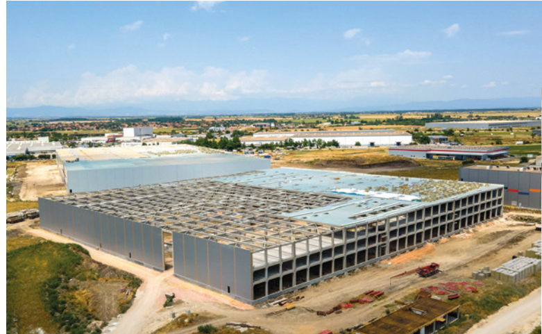
The columns and beams are mainly used for industrial buildings/halls.