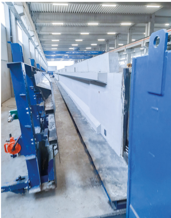
The extremely adjustable mould for I beams is 32 meters long and can produce high quality beams for medium and large industrial buildings.