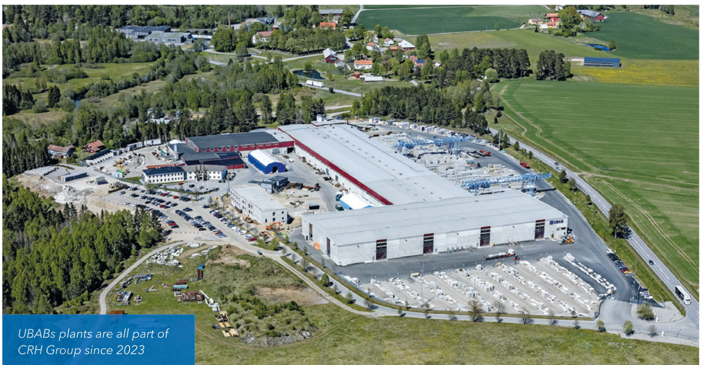
UBABs plants are all part of CRH Group since 2023

In 2021, UBAB conducted a detailed pre-study to evaluate various precast ERP systems. ERPbos from Progress Group emerged as the most suitable choice due to its extensive capabilities and the professional support. UBAB valued Progress Group as a supplier due to their size, ensuring long-