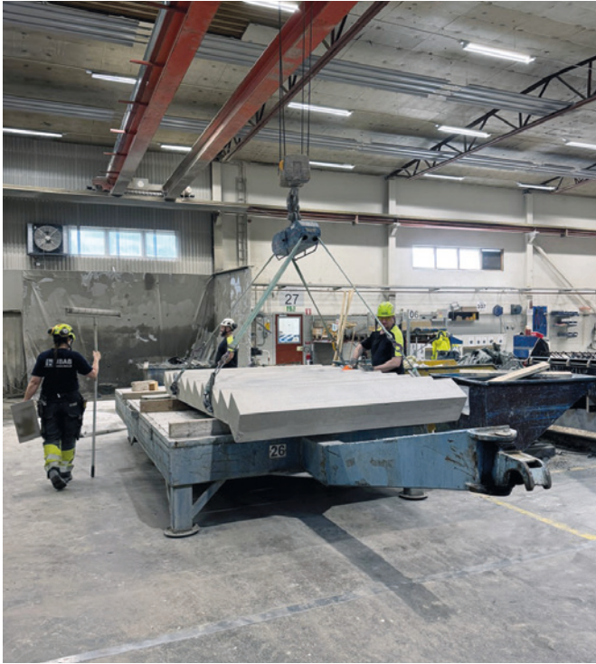
UBAB's stationary production

term collaboration and the availability of technical consultants. Additionally, Progress Group offers a standardized system adapted to optimally support precast best practices, a clear roadmap for future developments, and extensive testing in their own plant, making it an ideal partner for UBAB. Both plants, UBAB and Örs, use software from the Progress Group, and the third plant, Dala, will start using it in 2025.