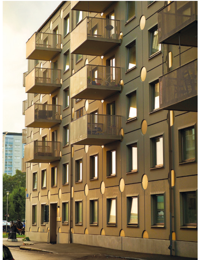
UBAB’s buildingproject called Lundbypark, 166 new cooperative apartments in Gothenburg

Production planning on a daily basis in aheadAPS and optimal layout planning for stationary production