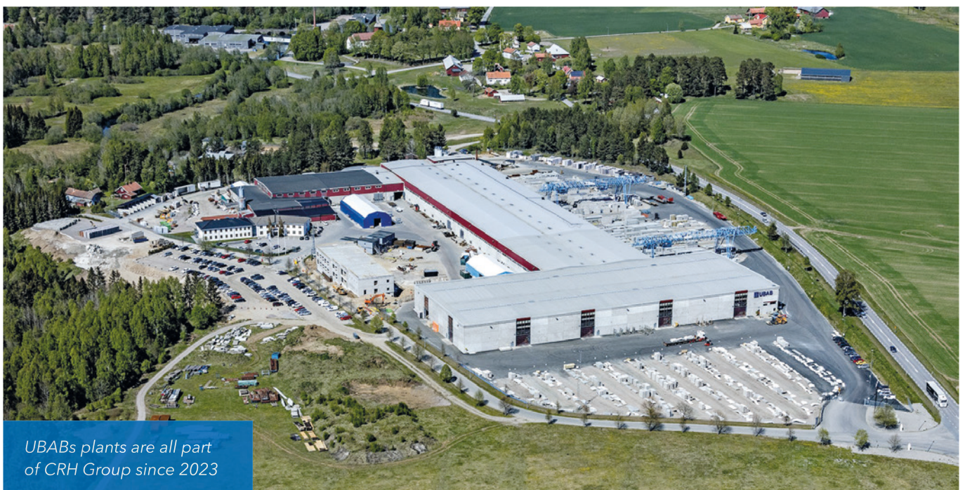
UBABs plants are all part of CRH Group since 2023

In 2021, UBAB conducted a detailed pre-study to evaluate various precast ERP systems. ERPbos from Progress Group emerged as the most suitable choice due to its extensive capabilities and the professional support. UBAB valued Progress Group as a supplier due to their size, ensuring long-