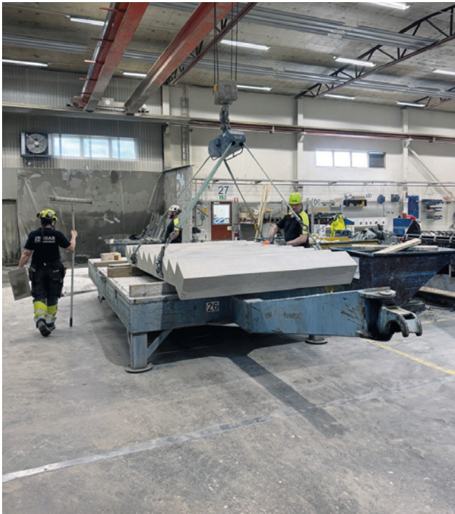
UBAB's stationary production