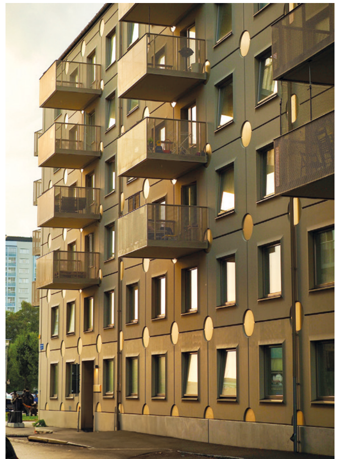
UBAB's building project called Lundbypark, 166 new cooperative apartments in Gothenburg

The integration of the mebos mobile app has been a game-changer for UBAB. Used for storage, molding, casting controls, and production updates, mebos provides real-time insight into the production state. This transparency allows management and supervisors to monitor progress accurately and address any issues promptly. The app also facilitates defect management, stock adjustments, material feedback, and warehouse operations, significantly reducing paper usage and improving the overall workflow.