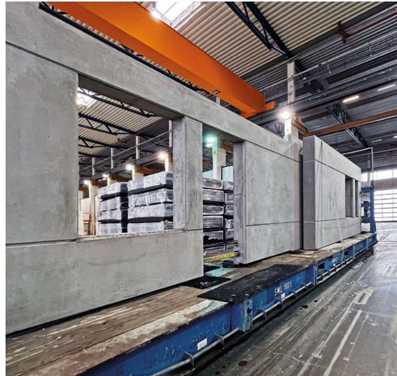
The now digitalized production is more effective with a higher quality of the final products.

term collaboration and the availability of technical consultants. Additionally, Progress Group offers a standardized system adapted to optimally support precast best practices, a clear roadmap for future developments, and extensive testing in their own plant, making it an ideal partner for UBAB. Both plants, UBAB and Örs, use software from the Progress Group, and the third plant, Dala, will start using it in 2025.