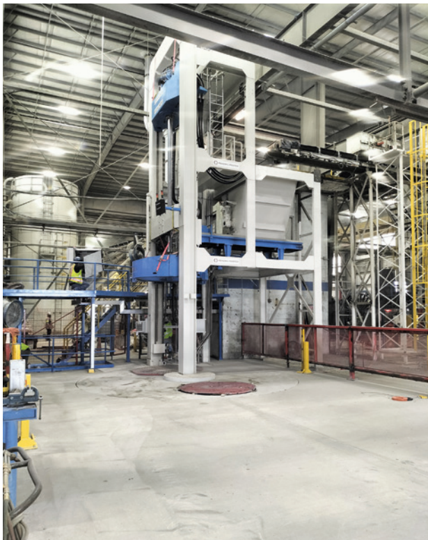
Start of commissioning and concrete pipe production

The machine includes the Karajan control panel with a visualization system from Prinzing Pfeiffer, built on the Simatic IPC427 platform with a Touch Panel by Siemens and running on the Windows 10 operating system. The system allows detailed control of the production process, provides diagnostics, and supports trend recording and PLC monitoring, all accessible via a user-friendly multilingual interface.