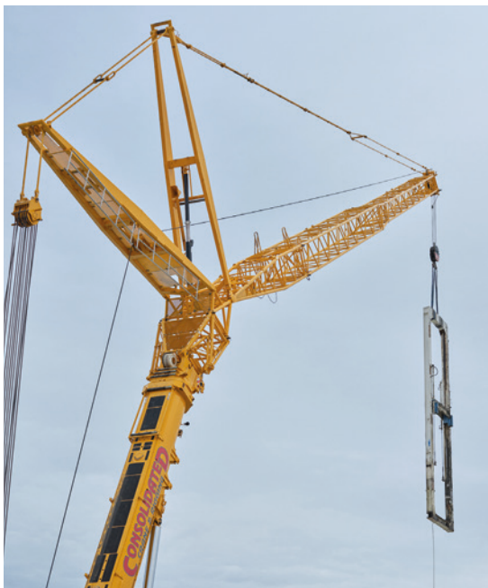
Radial Press RP 1635: Replacement after 15 years of continuous non-stop concrete pipe production