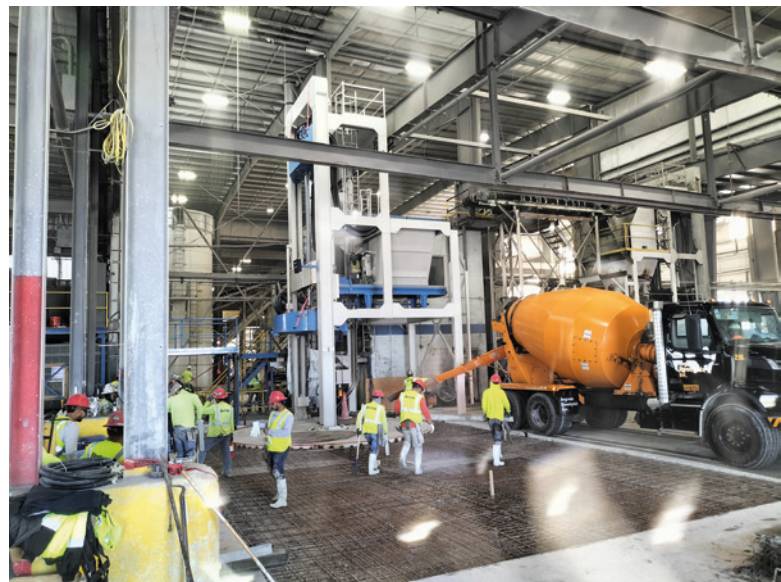
Final installation works

against the mould by a rotating roller head and distribution tools, preventing twisting of the reinforcement cages. It's capable of producing both thick wall and double-reinforced pipes.