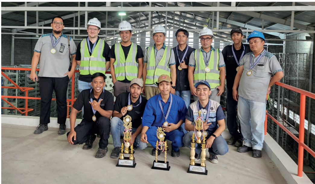
Picture of the hand-over of the machine on 29/02/2024: commissioning engineers Topwerk Middle East, project manager Hess and operators PT. Cisangkan

PT. Teksindo Serviguna Jl. Daan Mogot Km. 18 11850 Jakarta, Indonesia T +62 21 54390148 teksindo@rad.net.id