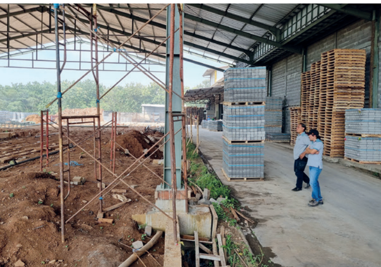
Foundation work for the new concrete block and paver line. On the right is the hall of the Hess RH 1500-3 concrete block and paver machine, purchased in 2010.

These components make the RH 1500-4 particularly efficient, leading to a significant increase in production capacity. This is particularly important for large-scale projects where time and quality are equally critical factors. The concrete block and paver machine is not only known for its performance, but also for its reliability and user-friendliness.