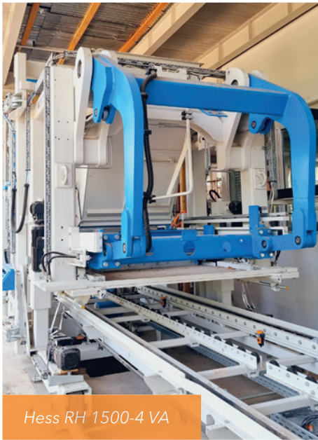
Hess RH 1500-4 VA