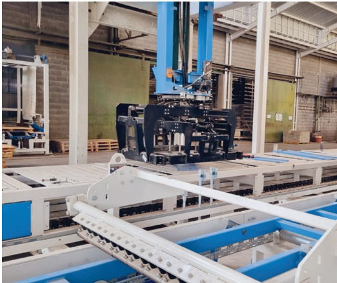
Hess Cuber Servo 700-2