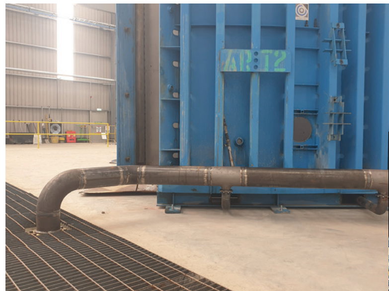
Primary Curing in the Permanent Facility - Pipe trenches keep the production floor free from obstructions. The vapor is always delivered at ground level, directly under the form for best temperature consistency.

The actual temperature value is read directly by the PLC which in turn provides a control signal to the automatic vapor