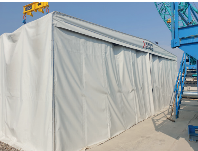
One of the five retractable curing enclosures (tents) initially supplied to the outdoor temporary casting area. The tents could be quickly dismantled and moved to the permanent facility once completed. A further ten tents were supplied as part of phase 2 delivery.

Inside the retractable curing enclosures, vapor delivery is provided by three each 2 ½" flexible steam hoses, which can be placed in any position within the enclosure. Special cylindrical diffusers ensure the vapor is distributed horizontally along the floor in a radial pattern from the hose outlet.