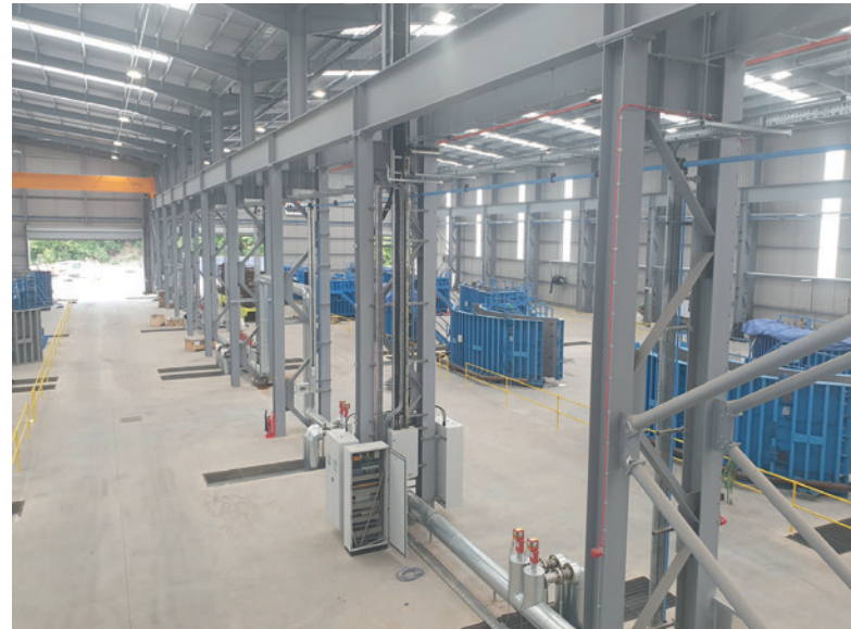
The images demonstrate how the carefully thought-out vapor piping layout blends in with the production area to avoid interference with daily operations.

valves. The automatic vapor valves allow supply or shut-down supply of vapor to the respective casting form, regulating the concrete temperature. The AutoCure program is designed to follow a pre-determined curing curve. Time and temperature parameters can