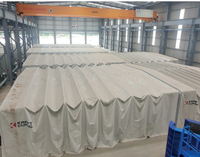
Some of the many retractable enclosures inside the secondary curing area. Each enclosure is capable of containing two concrete elements.