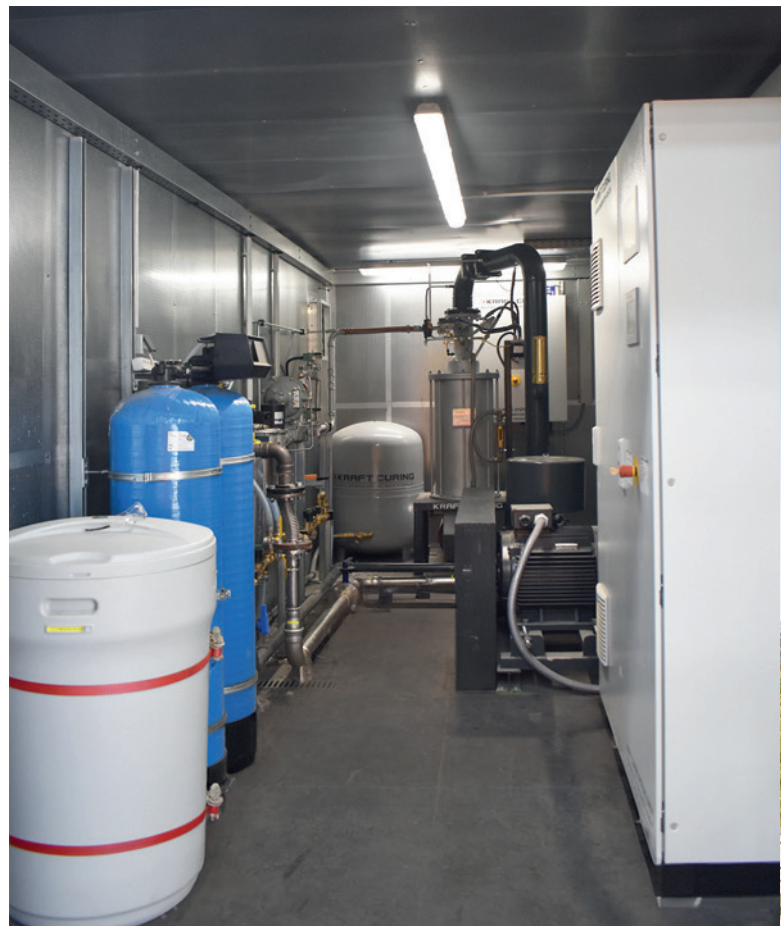
The Containerized Vapor Curing Unit with Water Treatment System.

The main heart of the curing system consisted of a KC 80-VS low pressure vapor generator. The natural gas fired 2,400 kWh variable-speed vapor generator was supplied pre-installed inside a 20' shipping container. Although natural gas was the chosen fuel source in this project, Propane is also possible. The container serves as a safe, secure and dust-free plant room for the generator and ancillary components. The