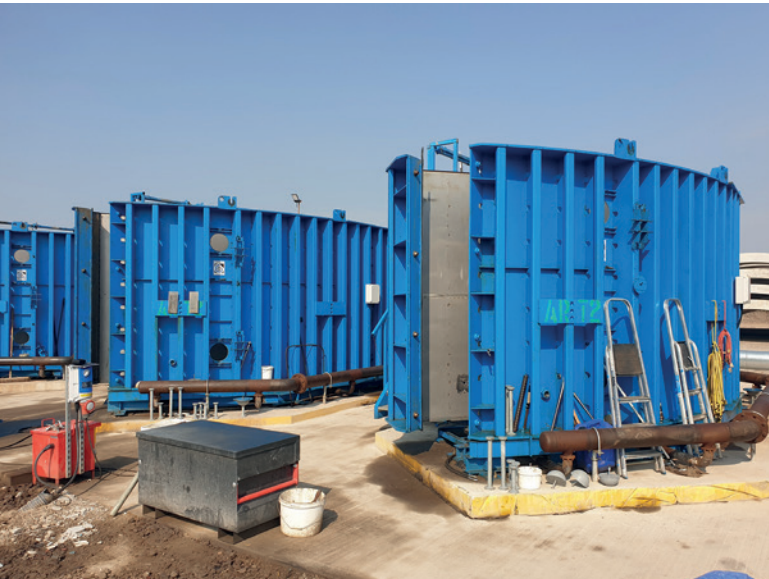
Outdoor temporary casting area allowed the customer to meet the project delivery schedule while awaiting completion of the permanent cast facility.

had to be provided in each case, but in general the concept was to use multiple smaller diffusion pipes to deliver vapor across the full length of the form directly under the structure. This also meant that the piping is not obtrusive to casting operations.