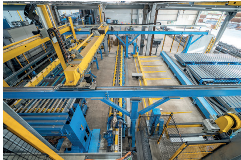
The M-System Smart Mesh welding machine is equipped with an additional bending machine, which facilitates fully automatic cage production.

ment as per CAD specifications, the Blue Versa lattice girder welding plant, the EBA automatic stirrup bender and the MSR multi-rotor straightening and bending machines, there are also absolute world firsts in use in the rebar shop and in the precast plant. The M-System Smart Mesh mesh welding plant with bending system can, for example, automatically produce extra-wide mesh and process it into a complete reinforcement cage. The Tube Master is a novel pipe-laying robot that automatically bends heating and cooling pipes for the production of thermally activated and energy-efficient precast concrete elements and lays them precisely on the pallet. This increases productivity and makes work easier. Other modern-