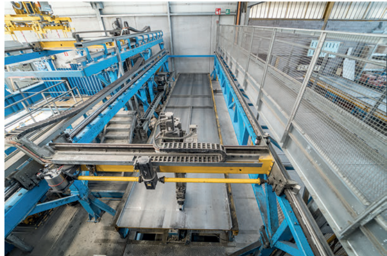
The Form Master shuttering and deshuttering robot can position the shuttering precisely according to the CAD data transmitted by the ebos® control system.

wall so that they do not need to be inserted manually. The GC base (the lower part of the Green Code Eco Slab recess body) is installed automatically in the factory using the Box Master, with millimetre precision and without any manual work.