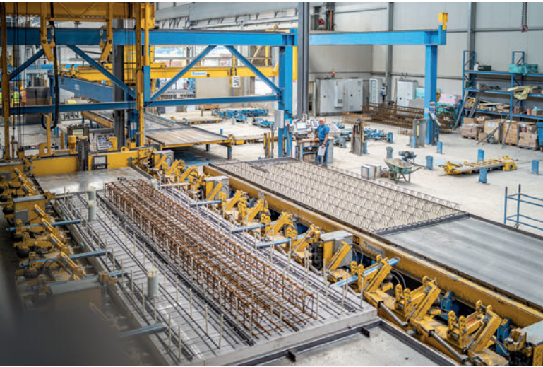
The precast plant at the headquarters of the company group, which specialises in automation and digitalisation, produces with its own machines and software.