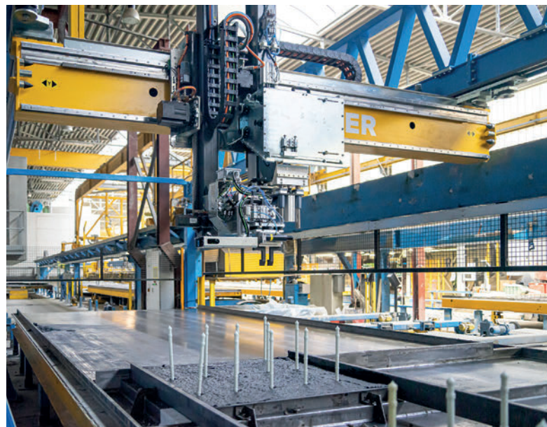
The Pin Master places the GC pins automatically straight through the insulating material into the fresh concrete, eliminating the manual insertion.