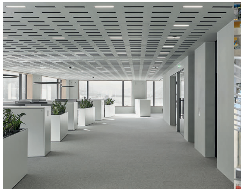
The headquarters in Brixen serves as a showroom for the innovative construction system, as it was built entirely with the company's own precast elements from the factory next door.