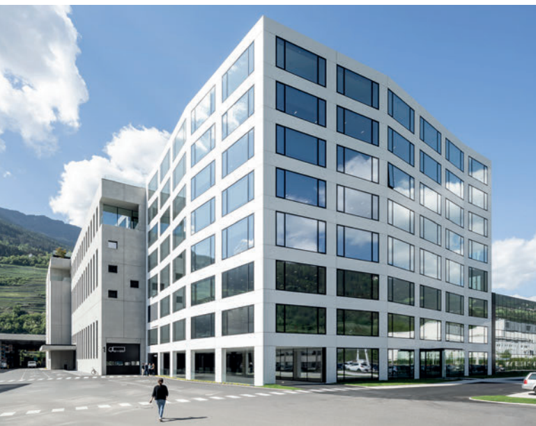
Just a few metres from the Progress Group's new headquarters, their own precast plant is producing precast elements.

Apart from the Progress Group's classic reinforcement machines such as a Wire Centre, which considerably improves the production process through the automated processing of reinforcing steel from the coil and the installation of reinforce-