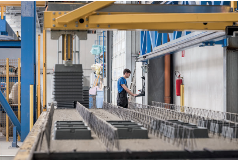
The Box Master places the lower half of the GC box (the GC base) fully automatically in the Green Code Eco Slab® at the plant - this is then completed on building site with the GC top, i.e. the other half.