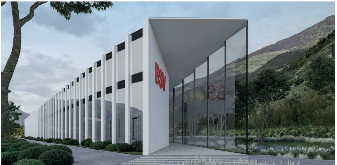
The new BSV headquarters is a prime example of how modern, sustainable and time-saving precast concrete elements can be used in construction.

Experience the future of construction at the Green Code Precast Days on 26 and 27 September at the PROGRESS GROUP headquarters in Brixen, South Tyrol!