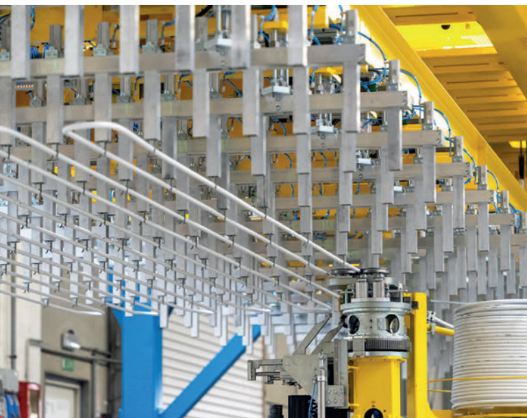
The Tube Master pipe-laying robot is a market first. It installs heating and cooling pipes fully automatically as part of the prefabricated ceilings.

Further, two impressive innovations were installed in the precast plant in 2023, which automate and efficiently organise the production of the licensed precast concrete elements, the Green Code Thermo Wall® and the Green Code Eco Slab®. The Pin Master automatically inserts the GC pins, thermal bridge-free connectors between the inner and outer panels of the thermal wall, into the insulating material of the thermal