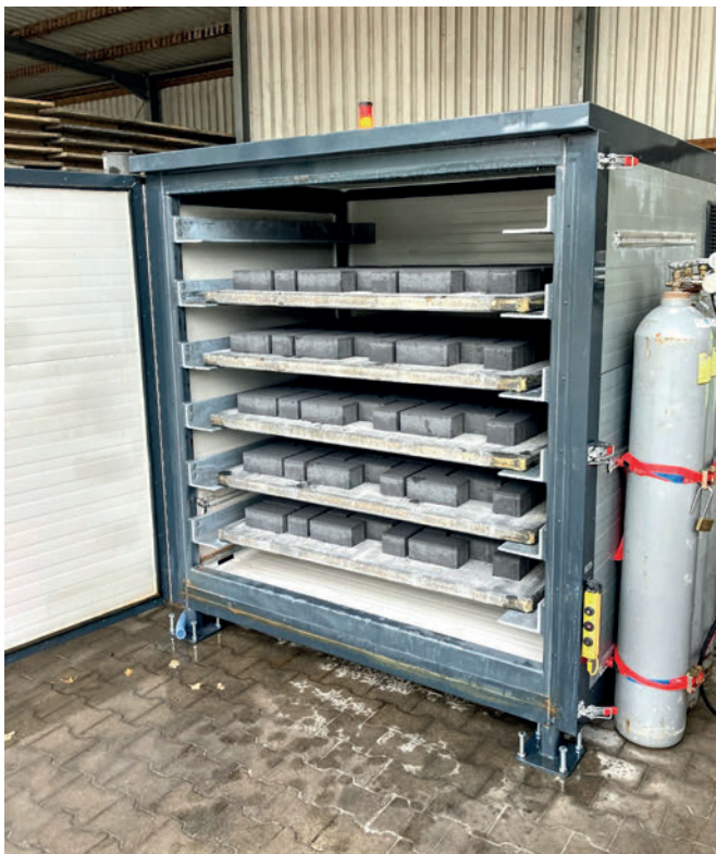
Production boards with fresh products in the TestCube

Kraft Curing Systems GmbH has dealt with the first variant and only added a small amount of CO 2 to the chamber to see how the products behave at lower amounts of CO 2 and what quality improvements can be achieved. It was not pri-