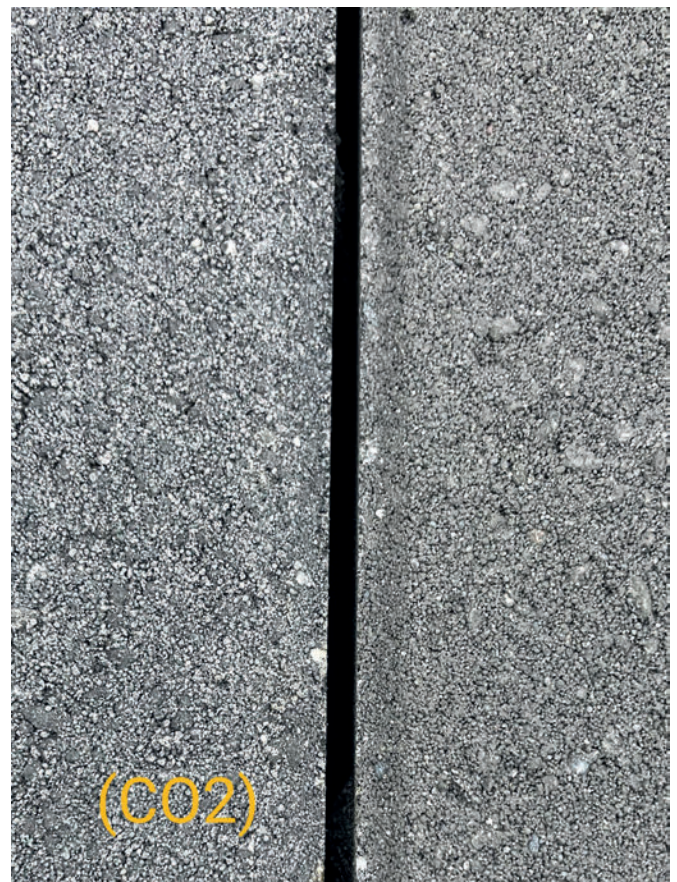
Product from above with CO 2 on the left and without CO 2 on the right

were no major changes in the concrete based upon the amount of CO 2 introduced, regardless of the concentration. The consumption amount was about 1 m 3 in all tests carried out, regardless of the curing time. This corresponded to 0.38 kg per board. If a factory produces 3,500 boards of concrete products in three-shift operation, this is over 1,300 kg of CO 2