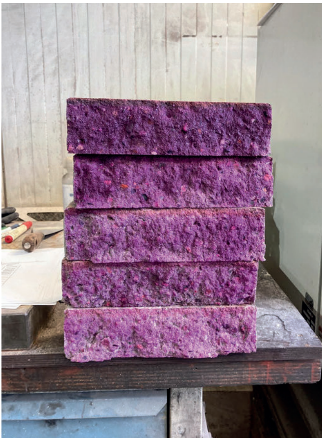
Products wetted with phenolphthalein indicator.

In order to ensure better comparability, the values in the Cube were adjusted to the existing curing chamber temperature and humidity values. This is particularly important since the curing process can already show clear changes due to heat and moisture if different curing conditions are created. In order to determine the displacement factor of the TestCube for CO 2 , it was emptied and gassed before the test. This generated a factor that is important for the evaluation.