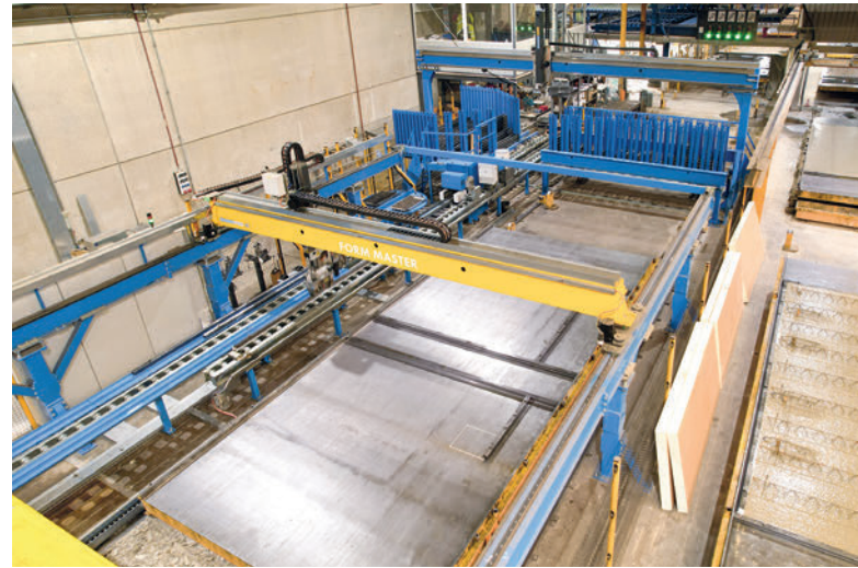
The Form Master makes it possible to achieve a high level of precision and work without disposable fillers.

trend is towards an imminent recovery in the market after the current crisis.