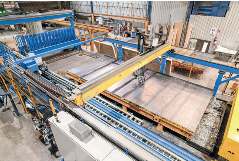
The Form Master shuttering and demoulding robot places and removes the shuttering fully automatically and precisely according to CAD specifications.