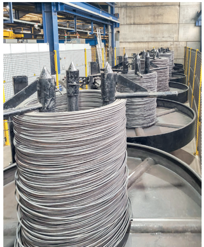
The reinforcement machines work directly from the coil and thus avoid waste.

production time without disposable fillers. With the M-System BlueMesh mesh welding machine, the required meshes are produced flexibly and just-in-time from the coil. In addition, the low current connection values thanks to Progress inverter welding and production without waste and time-consuming cutting of the reinforcement mesh ensure efficiency and cost-effectiveness.