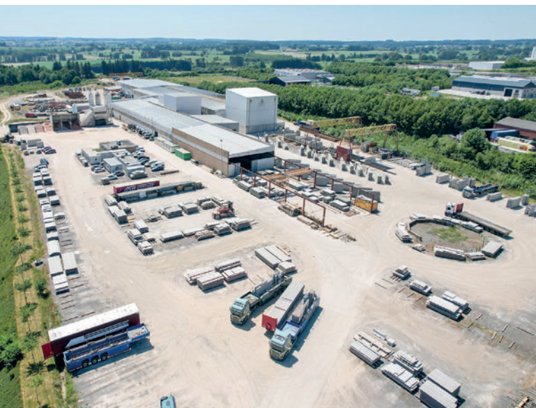
Alpha Beton has been producing precast concrete parts since the 1990s - initially with a lot of manual labour and now highly automated.