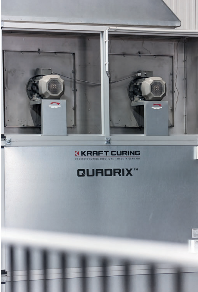
The Quadrix curing system accelerates the curing process through the controlled addition of heat and moisture

The warm and/or humid air is distributed in the chamber via a total of 118 outlets, located at the floor, and a total of 104 return ducts at the chamber ceiling. This design takes advantage of warm air's natural tendency to rise and ensures the exchange of to insure temperature and humidity uniformity within the entire curing environment.