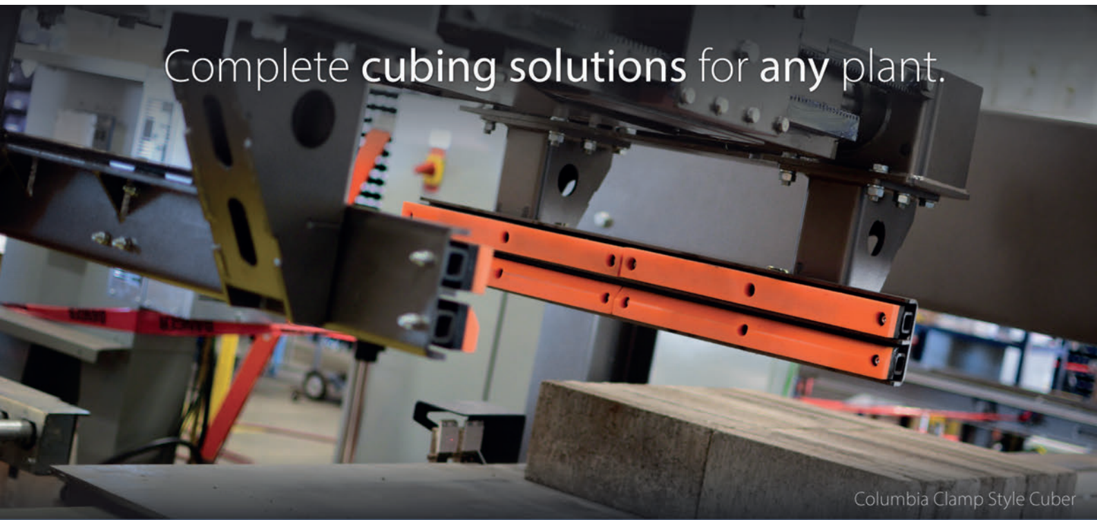
Columbia Clamp Style Cuber

In the light of previous experience, Kraft Curing Systems GmbH has abandoned the simple extraction systems available on the market and opted for centralised extraction in its curing chambers. Extraction is necessary when the curing temperature is too high or, as is more frequently the case, when the relative humidity is too high. Instead of a single point of extraction in the rear wall of the chamber, Kraft's central system extracts from 104 locations in the chamber - ensuring uniformity and allows for the incorporation of a heat recovery system in order to further reduce energy costs. Kraft's heat recovery unit saves between 30% and 75% energy