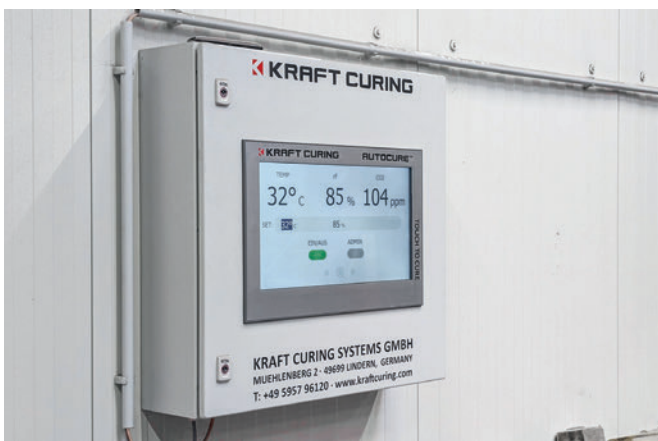
AutoCure® Accelerated Concrete curing chamber control screen

The collaboration between Kraft Curing Systems and Betonwerk Lintel on the chamber construction went very smooth. Both companies can look back on years of working together as partners, which is reflected in a high level of trust and mutual understanding. Conversion planning and implementation were carried out in close coordination between the two companies. Kraft Curing Systems GmbH contributed its ex-