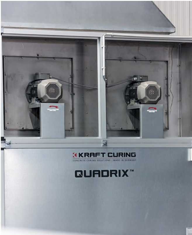
The Quadrix curing system accelerates the curing process through the controlled addition of heat and moisture

The warm and/or humid air is distributed in the chamber via a total of 118 outlets, located at the floor, and a total of 104 return ducts at the chamber ceiling. This design takes advantage of warm air's natural tendency to rise and ensures the exchange of to insure temperature and humidity uniformity within the entire curing environment.