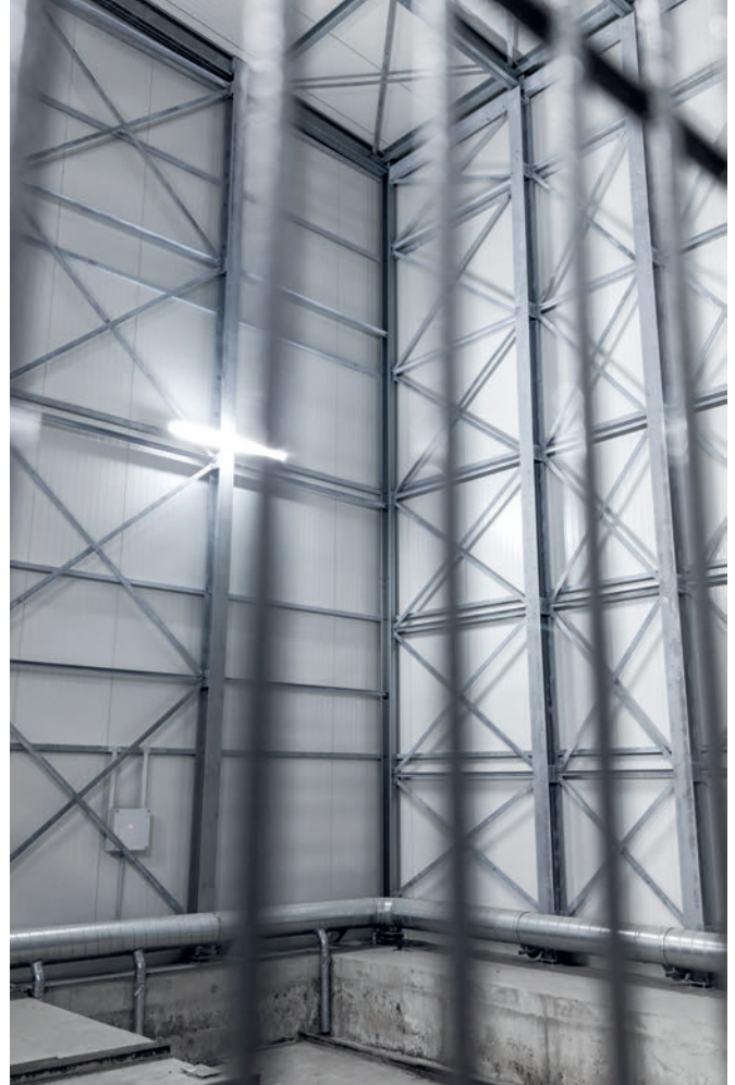
The air distribution system in the transfer car area and pit

Kraft Curing Systems GmbH equipped the curing chamber at Betonwerk Lintel with a safety passage at the rear of the chamber passages - eliminating any chance whatsoever of personnel being trapped by the finger car and allowing for a quick and safe exit from the chamber. The exit is equipped