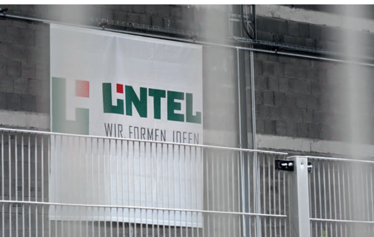
The Lintel Group banks on curing technology from Kraft Curing Systems GmbH

An efficient variable output burner, with a maximum output equal to 150 kW/h (500,000 Btus/h), was selected to heat the air as required with a total air circulation within the chamber equal to up to a total output of 60,000 m 3 /h. The complete curing system is named Quadrix (as it encompasses four important parameters; temperature control, humidity control, air circulation and insulation) and accelerates the curing process through the controlled addition of heat and moisture. Specially developed aluminium radial ventilators and a stainless-steel heat exchanger allow the system to work with high levels of humidity. Such systems have been specially optimised for use in concrete production facilities with the stainless-steel housing insulated to reduce heat loss and prevent condensation.