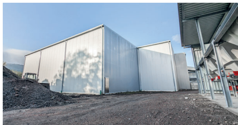
Curing chamber as a free-standing building and stainless steel escape door