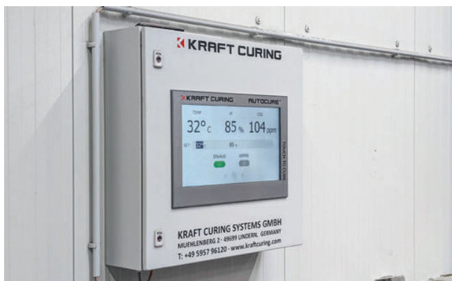
AutoCure® Accelerated Concrete curing chamber control screen

The collaboration between Kraft Curing Systems and Betonwerk Lintel on the chamber construction went very smooth. Both companies can look back on years of working together as partners, which is reflected in a high level of trust and mutual understanding. Conversion planning and implementation were carried out in close coordination between the two companies. Kraft Curing Systems GmbH contributed its ex-