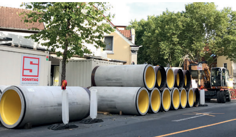
Datteln project, North Rhine-Westphalia, Germany: Site warehouse for DN 1200 Perfect jacking pipes from Beton Müller.

Whenever one of the conditions in a pipeline project is to provide protection against chemical attack, questions always arise concerning feasibility and durability with regard to long-term use. This starts with the choice of material, includes the installation conditions, and ultimately means that pipe producers need to meet special requirements. The polyethylene liner material processed by Beton Müller on an industrial scale provides the basis for the tightness of the pipe liners. The welding and forming processes are subject to ongoing