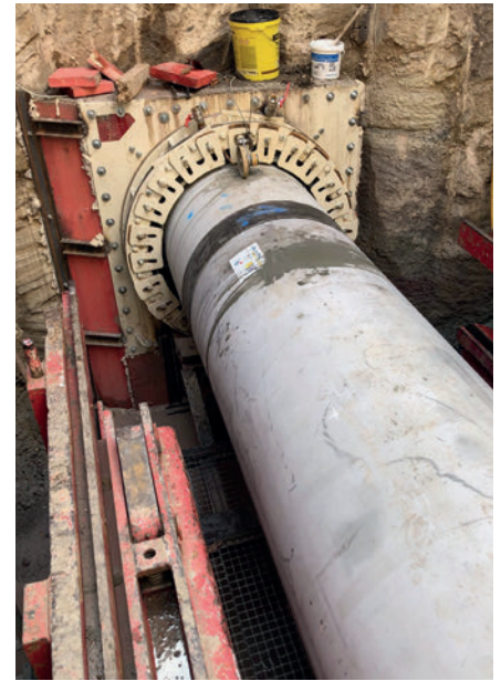
DN700 project, Medernach, Luxembourg: Starting pit

checks by internal and external monitoring teams, and ensure that there is corrosion protection in the pipe from the spigot to the joint. The connectors perfectly complement the hybrid pipe. They are mounted in the pipe in the starting pit before the next pipe is positioned. They provide a flexible but tight connection in the pipe joint both during and after insertion, such as in the event that the pipeline is repositioned in the substrate. Two external gaskets on the connector ensure that there is always corrosion protection, even in the joint.