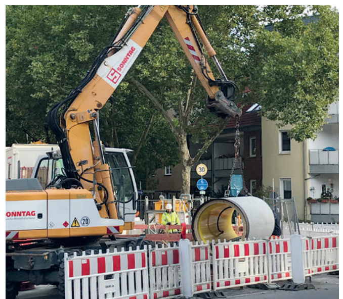
Datteln project: Lifting into the starting pit, piping detail with bentonite lubrication.