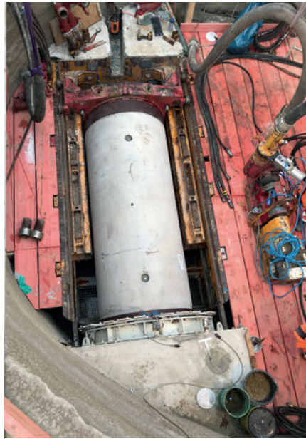
Datteln project: The next pipe is pre-pressed, while the joint is already mounted by means of plug-in connection (connector).