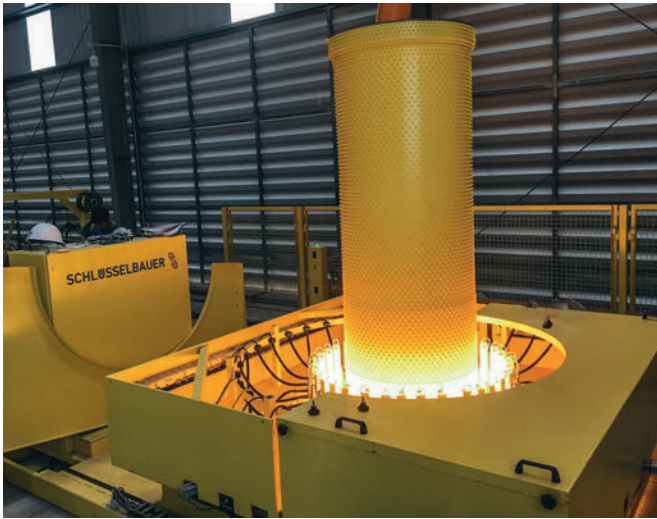
Thermoplastic forming of the liner to the inner joint