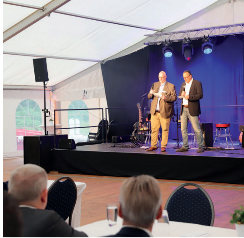
Welcoming the guests to the evening event

The affiliated companies of the Topwerk Group - SR Schindler, Prinzing Pfeiffer and Hess AAC - were also represented at the event. They demonstrated the breadth and expertise of the company's portfolio with their exhibition areas.