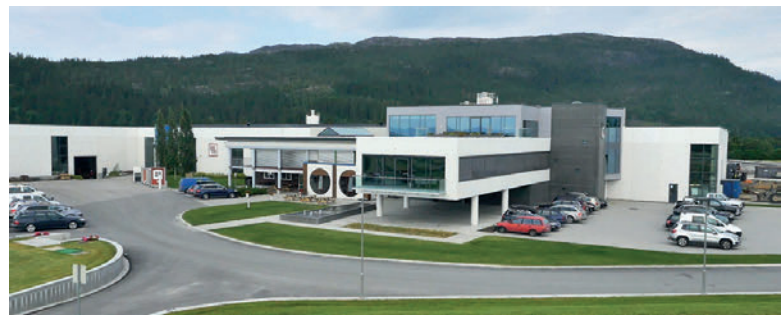
Overhalla Betongbygg is Norway's leading concrete plant in automation and digitalization.

The new mesh welding plant produces not only flat mesh but also fully bent reinforcement cages. The use of the so-called single bending heads is the first of its kind in Scandinavia. The 20% steel reduction comes from the machines possibil-