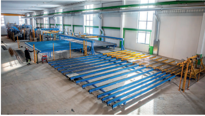
The mesh welding plant M-System BlueMesh is handling the production of flat and bent mesh automatically according to the CAD data.