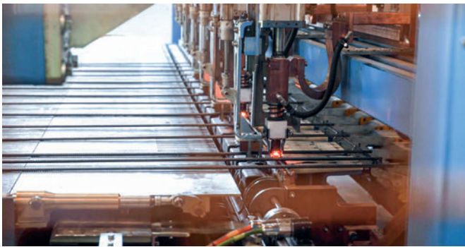
This advanced plant can produce mesh and cages in all shapes and sizes.