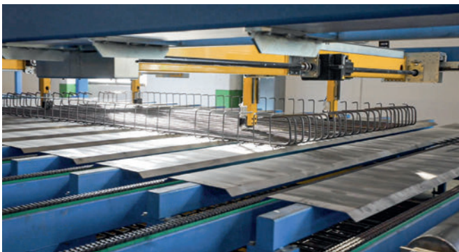
The fully automated bending solution ensures a high quality of the reinforcement cages.