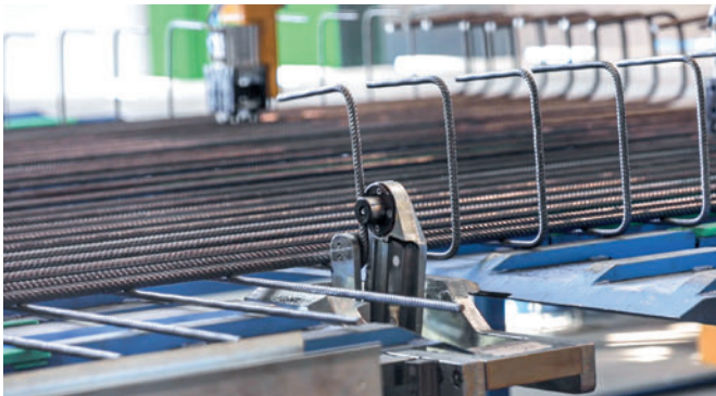
With the single bending heads the wire can be bent exactly according to plan without manual labour.