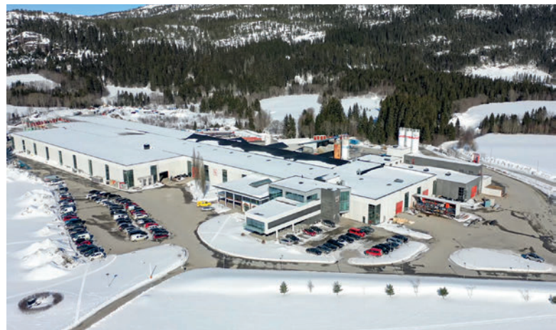
The precast plant in the town Overhalla is producing building materials since the 1940's.

ities for using different wire diameters from 6 to 16 mm and change them automatically in no time. This means, that the M-System BlueMesh can produce according to specific requirements and avoid oversized elements. Another point that helps to reduce steel consumption is the high flexibility of the machine working directly from coil being able to perform cut outs in the right geometry. The bespoke mesh also ensures a higher quality of the concrete elements. If the formwork is placed incorrectly, it will soon be discovered when the complete mesh cage is placed into it. This is an additional control that Overhalla Betongbygg has not had before, and which helps to increase quality.