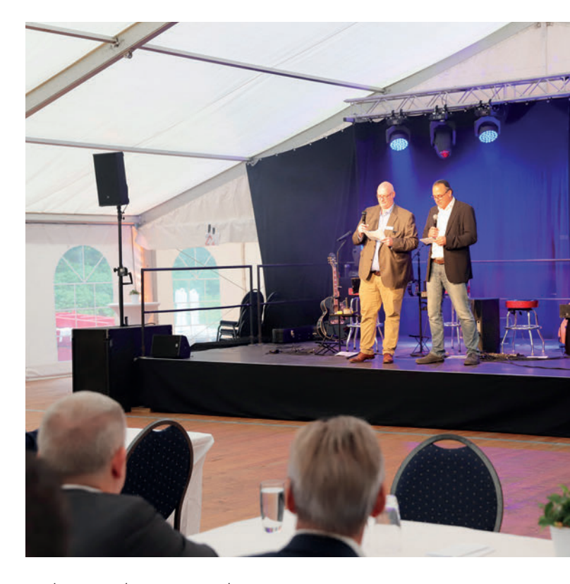
Welcoming the guests to the evening event

The affiliated companies of the Topwerk Group - SR Schindler, Prinzing Pfeiffer and Hess AAC - were also represented at the event. They demonstrated the breadth and expertise of the company's portfolio with their exhibition areas.