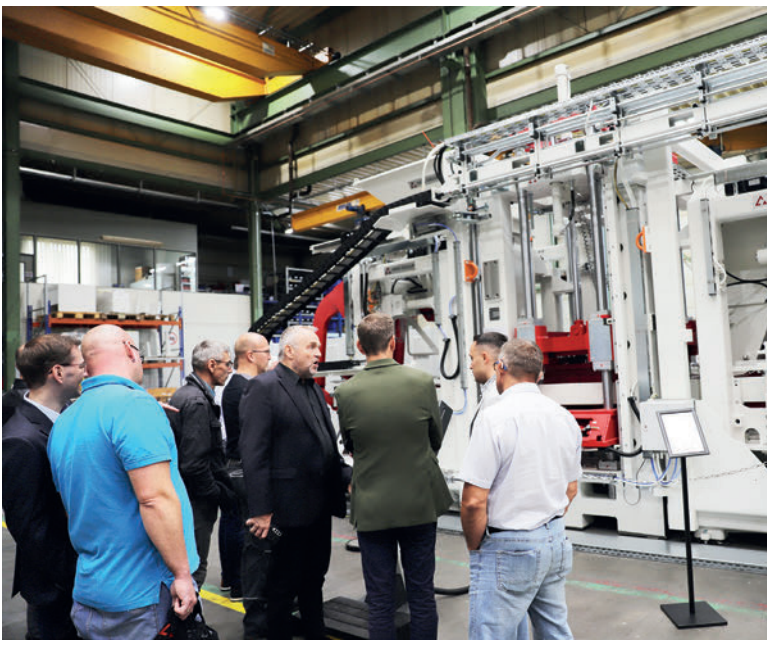
The diverse exhibition programme included machines such as the RH 2000-4

CPI – Concrete Plant International – 6 | 2023 www.cpi-worldwide.com