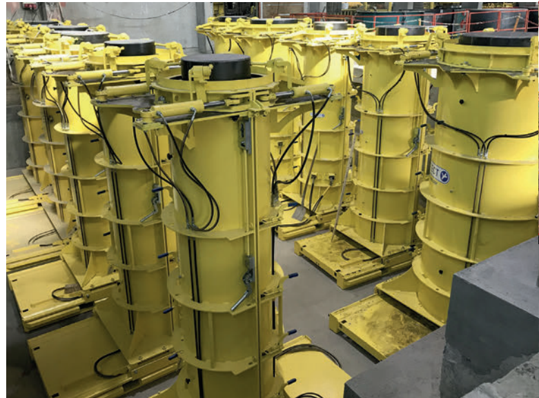
Production of jacking pipes at Beton Müller with Perfect moulds from Schlüsselbauer Technology