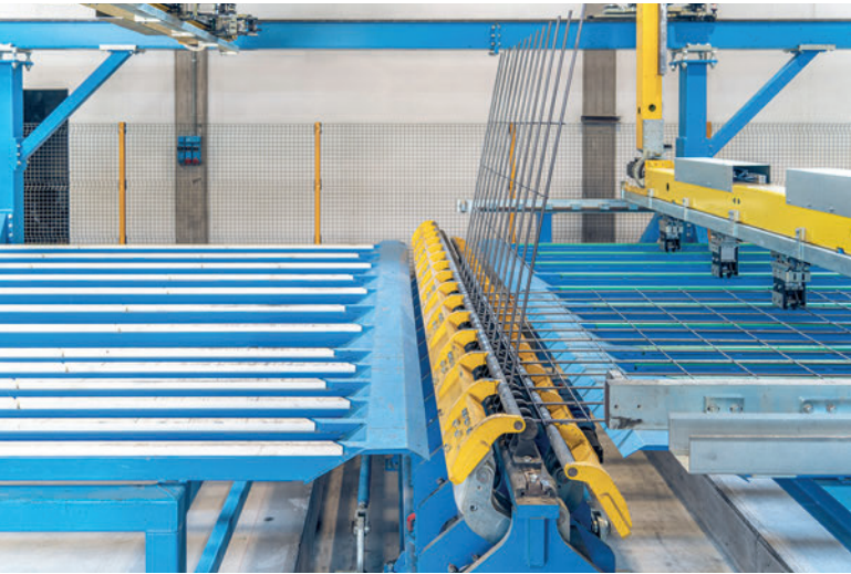
The plant is equipped with a flexible mesh bending system.

integrated windows of different shapes and sizes. With the BlueMesh, Prefabbricati LP can produce meshes of up to 8 x 4 m. The plant can be used flexibly and can produce any type of welded mesh, also for reinforcement sales. The special requirement was to design a system in which the welding of the bars is possible from above as well as from below. This is necessary in order to comply with both the Italian Ministerial Decree 2018 for technical constructions in Italy and the Eurocodes II in relation to European regulations. These regulations require the installation of load reinforcement (transverse) within the structural elements, but also load distribution reinforcement (longitudinal) of about 20%. This must be embedded in the concrete core - one reason why Prefabbricati LP had to make these special demands on Progress Group. In this way, reinforcements are produced with welds of the longitudinal bars made both at the top and at the bottom, which means that the meshes now do not have