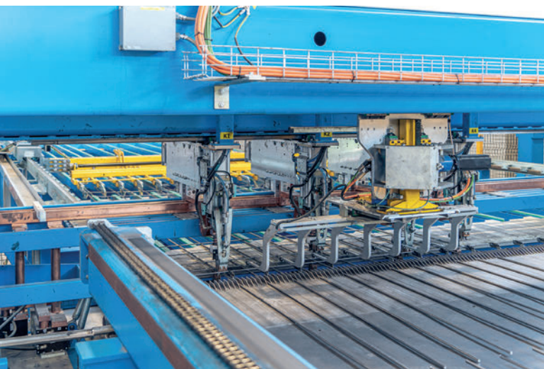
Progress Group engineers developed this customised system based on Prefabbricati LP's requirements.

In addition to the mesh welding plant, Prefabbricati LP has invested in an EBA automatic stirrup bender, which is used to produce steel stirrups in a variety of shapes directly from the coil. The automatic stirrup bending machine has a fast wire changing system and an automatic straightening tool adjustment, which ensures high productivity and thus further increases the efficiency of the entire system.