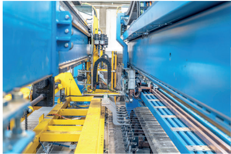
The possibility of welding longitudinal bars both at the top and bottom is an innovation developed for Prefabbricati LP.

integrated windows of different shapes and sizes. With the BlueMesh, Prefabbricati LP can produce meshes of up to 8 x 4 m. The plant can be used flexibly and can produce any type of welded mesh, also for reinforcement sales. The special requirement was to design a system in which the welding of the bars is possible from above as well as from below. This is necessary in order to comply with both the Italian Ministerial Decree 2018 for technical constructions in Italy and the Eurocodes II in relation to European regulations. These regulations require the installation of load reinforcement (transverse) within the structural elements, but also load distribution reinforcement (longitudinal) of about 20%. This must be embedded in the concrete core - one reason why Prefabbricati LP had to make these special demands on Progress Group. In this way, reinforcements are produced with welds of the longitudinal bars made both at the top and at the bottom, which means that the meshes now do not have