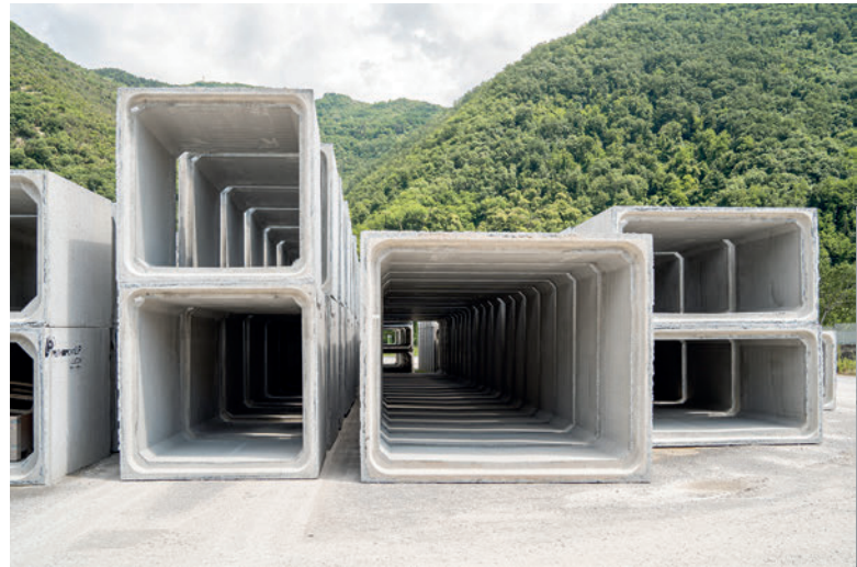
The products are used throughout Italy for large infrastructure projects such as motorways, bridges and railways.

Prefabbricati LP was founded in 1989 by Lumini Vittorio in Diecimo/Lucca. The family-run company has its roots in the production of precast concrete elements. The location in central Italy is a great advantage, because the company supplies its products to companies all over Italy, even to the islands and to southern France, Austria and even parts of Switzerland. The most recent deliveries went to large construction sites throughout Italy. Prefabbricati LP manufactures reinforced concrete products. The core business is the production of box-shaped precast concrete elements. In addition, pipes with different diameters are produced. The modular blocks – monolithic concrete modules measuring 1.6 x 0.8 m – are CE-marked and are among the few products of this kind manufactured in Italy.