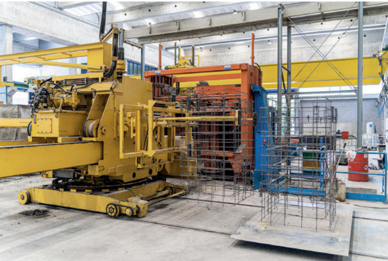
Straightened and bent reinforcement elements are the basis for the final product.