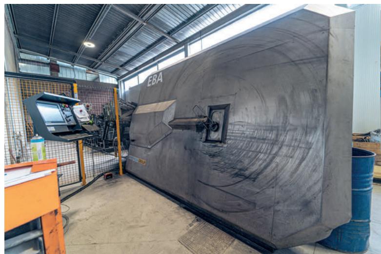
The EBA automatic stirrup bender produces stirrups in various shapes and sizes.