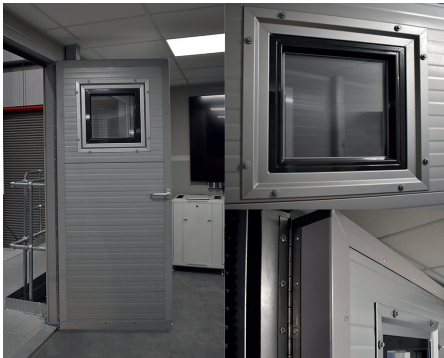
Details of personnel doors made out of sound-absorbing material.

Personnel and double doors are handmade to fit onsite during the erection process, using the same sound-absorbing materials as the walls and ceiling of the sound enclosure. The series of pictures below show the level of detail that goes into the design and fabrication of the personnel door with a window between the machine room and the control room.