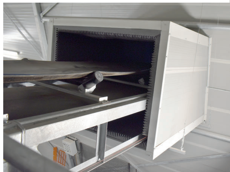
All inlet and outlet tunnels are sound insulated to reduce sound released into the production area as much as possible.