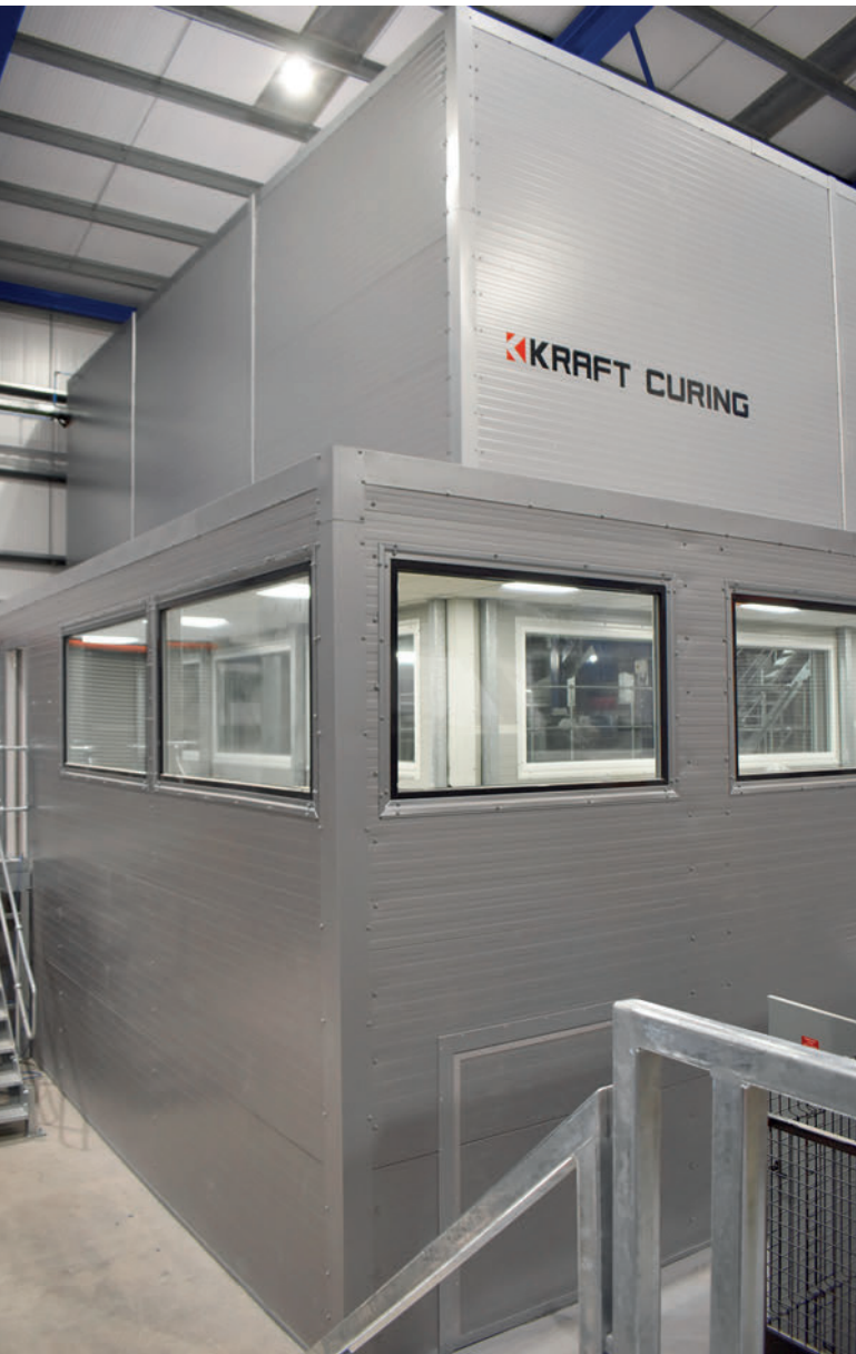
The outside of the control room and machine room, visible from the factory.

factory. These large window areas had the potential to create challenges with meeting the noise limits. A unique window solution from the petrochemical industry provided excellent sound dampening characteristics that eliminated the concerns with the large windows.