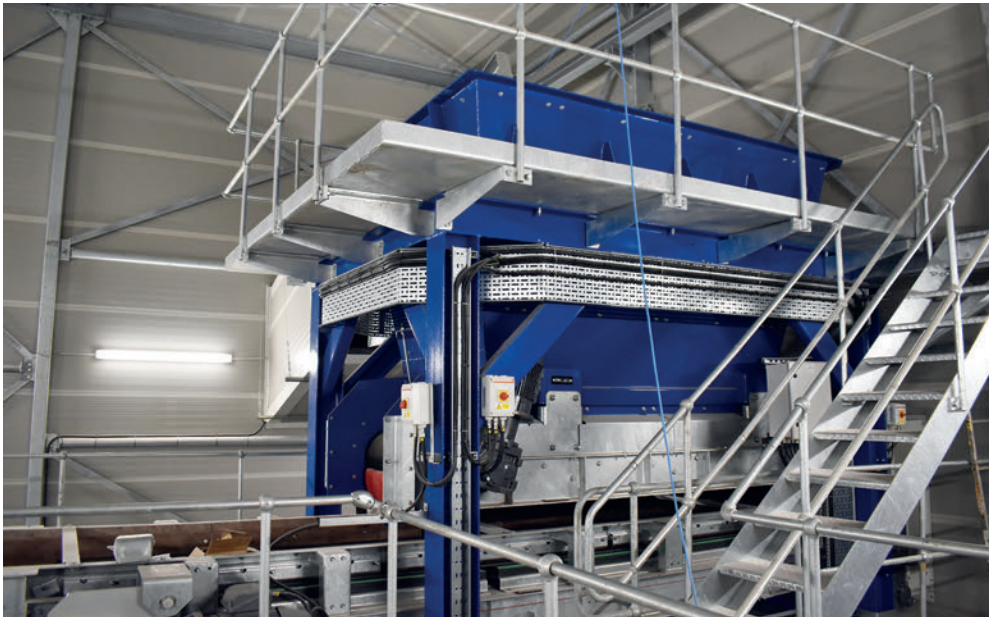
The Columbia Model 1600 block machine sits in the sound-insulated machine room.

the market and a partnership agreement with an acoustic engineering firm, Kraft Curing made the decision to supply their first sound enclosure and control room. The goal was to supply the highest level of noise abatement available in the industry in order to provide the safest and healthiest working environment and not simply be an “also ran.”