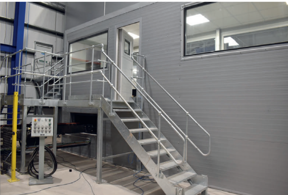
Unique window solutions allow for noise reduction and visibility into the factory and machine room.

Visibility into the factory (wet and dry sides) and into the block machine room were very important requirements of W.D. Lewis. There are over 15 m 2 window area facing into the block machine room and 17 m 2 window area facing into the