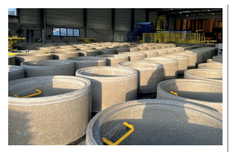
Manhole risers for sewage, with step rungs and anchors

sewage), manhole bases (likewise blank or with standard channels), and tall conical manholes with heights up to 2400 mm. Most products are supplied with or without anchors, with or without step rungs, with or without reinforcements, and in two different designs, depending on the joint type. Not only has the installation of Schlüsselbauer's new Magic production system increased Plattard's capacity to produce, it has cemented the company's trust and reliability of its machines to meet its goals of providing quality and service to their market, and it makes Plattard better positioned to tackle the challenges of a rapidly changing and competitive manhole market.