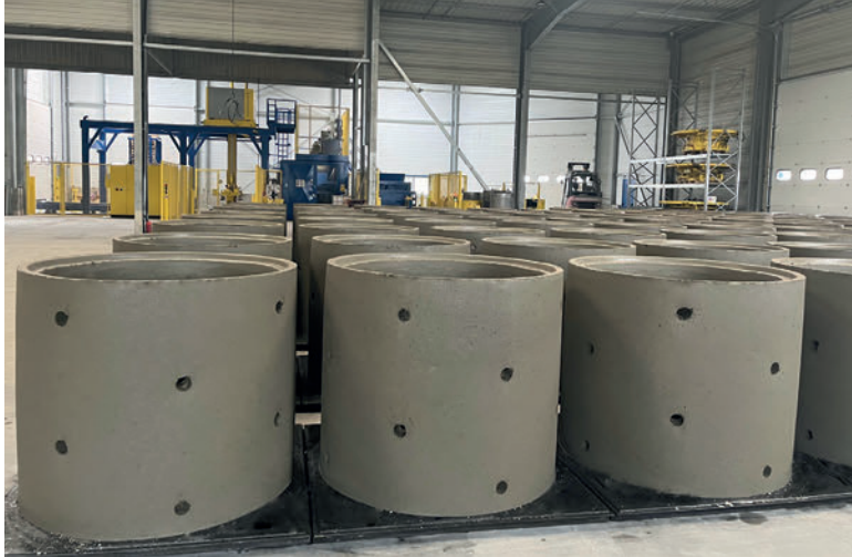
Optimum location of the curing area (here with manhole rings with drainage holes for rain water) in the hall between the production machine and palletizing system.