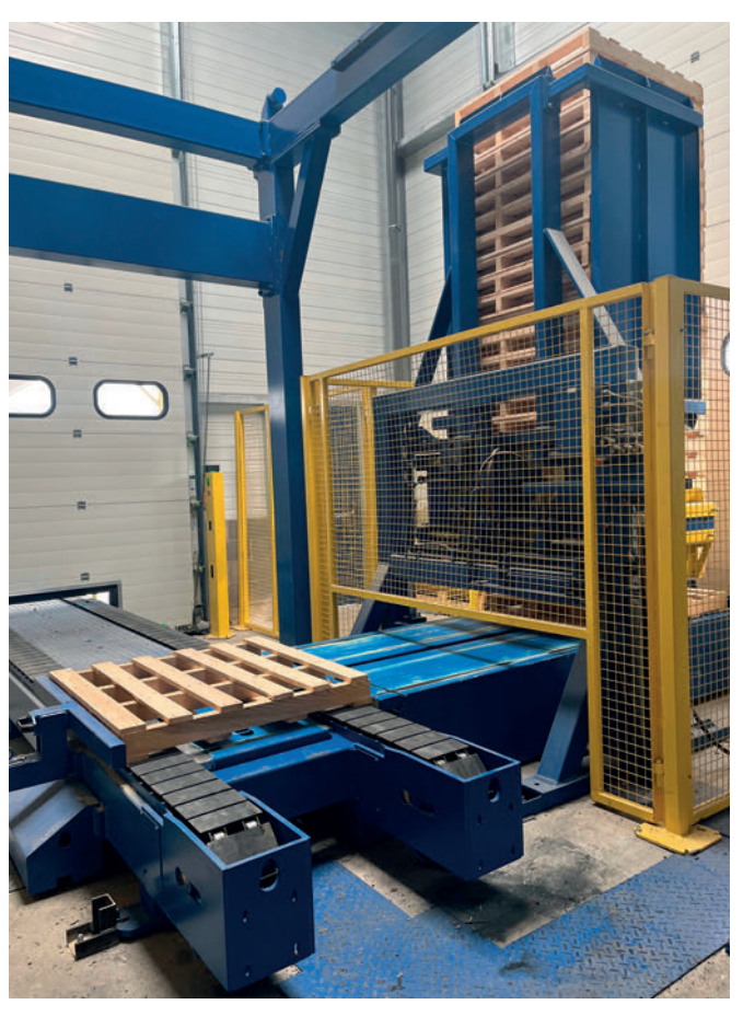
The pallet magazine is loaded from the outside, which is easy and safe.

Both companies were able to use the time of the project planning and the system production in Austria to prepare a