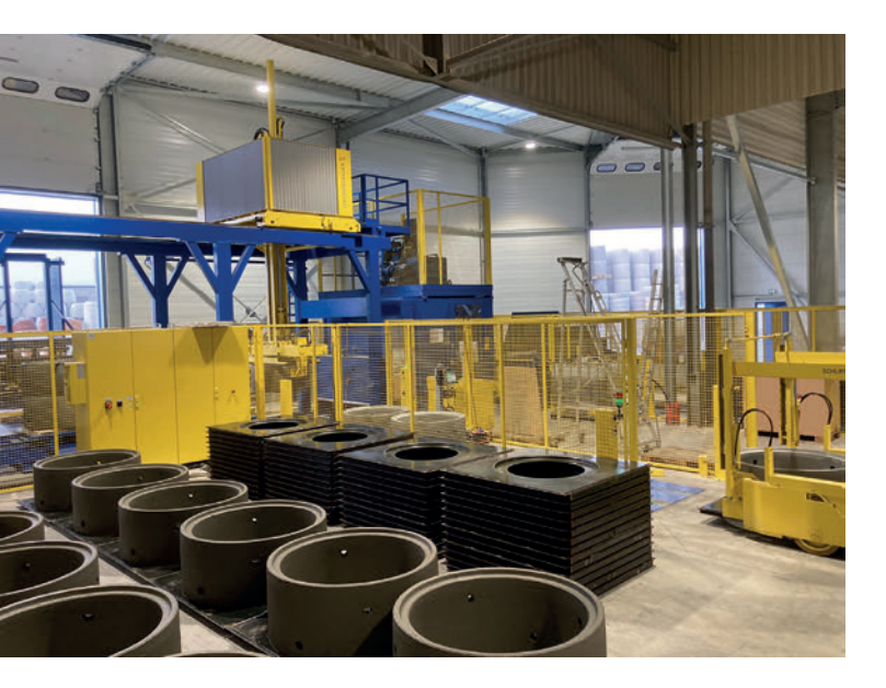
View of the palletizing system in the extension building.

technological standards – i.e. one that has been improved through continuous technological optimization by Schlüsselbauer and which has also been designed for automatic insertion of anchors and step rungs. There is also a device that assists in the insertion of reinforcements for certain products, such as cover plates, as well as a device for placing set rings. What's more, the machine also meets the goal of increasing productivity to 200 manhole components per shift—and sometimes even more for moderately sized products that are not overly complex, such as DN 1000 manhole risers with a product height of 600 mm, with two anchors and two step rungs.