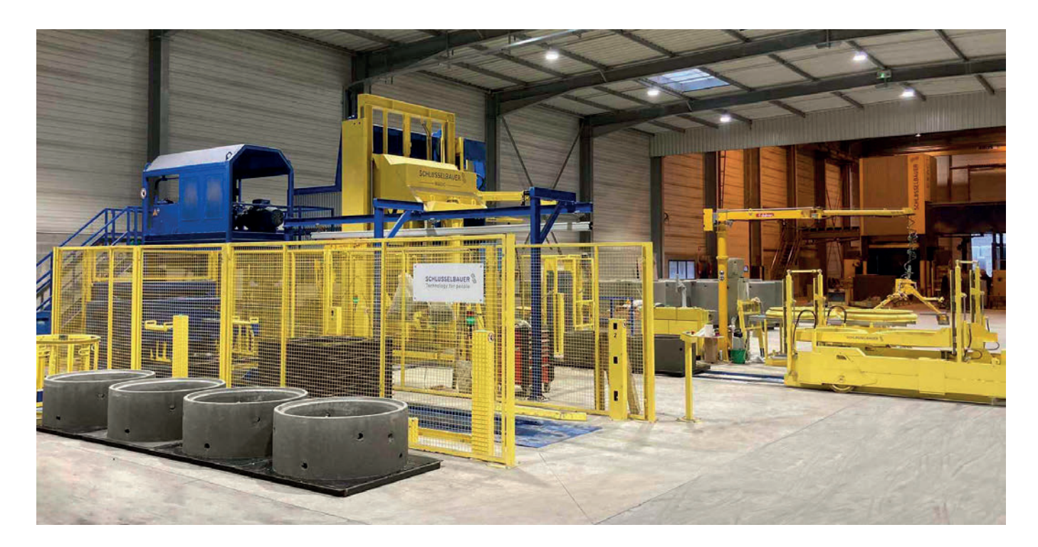
The new Magic 1501. Schlüsselbauer's Exact machine can be seen in the background.

By car, Villefranche-sur-Saône is a half an hour drive north of Lyon, in the heart of an economically strong and dynamic region, and it has been the home for Plattard since 1885. The family-run company primarily has its hands in two key