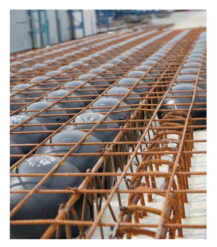
One of the main products and best seller of IJM is the bubbledeck slab.