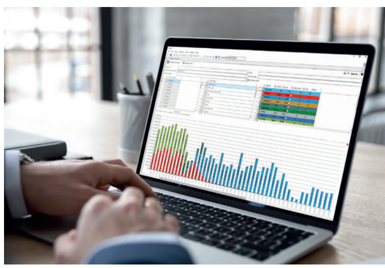
e<sup>rp</sup>bos supports IJM to ideally plan capacities and production to achieve maximal productivity.

as well as optimal production planning significantly increase productivity and prevent production downtime thanks to always up-to-date stock levels.