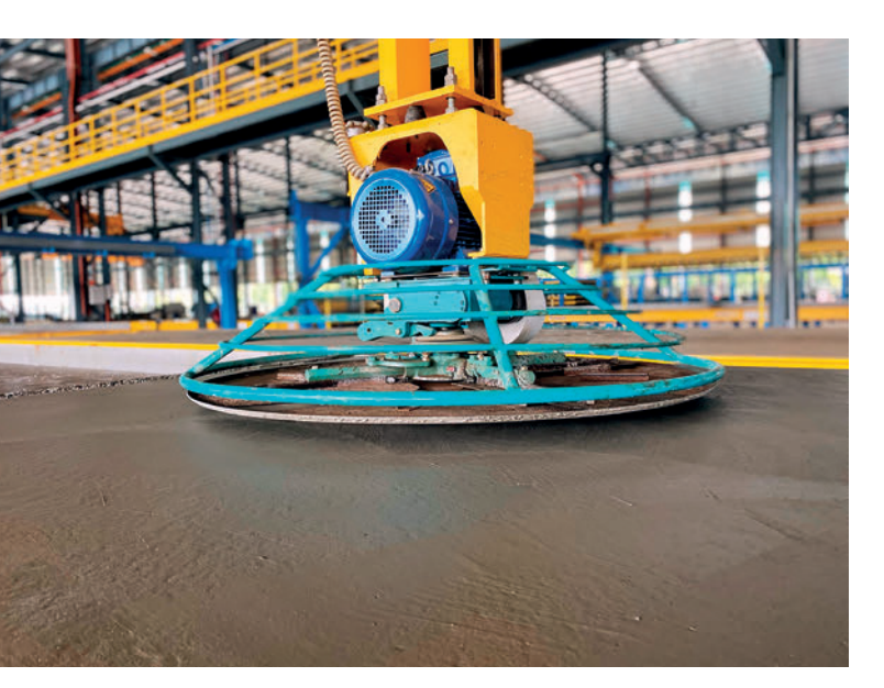
Effortless Finishing: Power trowel creates smooth surfaces, eliminating the need for painting.

Progress Group also supports IJM IBS as digitalization partner on their way to a digital factory. The broad product portfolio of software solutions from Progress Group, based on the three pillars BIM, ERP and MES, guarantees a perfect integration of all business and production processes from a single source. IJM was already able to achieve a higher efficiency in their automated plant with Progress' specialized MES software, ebos®. ebos is a complete software solution for work preparation, production and process management, control and analysis and delivers an overall picture of the whole production process. Beyond that, with the mobile application mebos, storage control and manual adjustments in the external warehouse can be handled easily. In addition to the MES system, IJM also chose Progress' ERP solution emphos, which was developed specifically for the precast concrete industry. The whole process chain can be managed in erpbos, allowing IJM to always have a complete overview of its business and performance. Due to the openness of the Progress' software, it was no problem to interface erpbos to SAP, which is used as a corporate wide ERP-System for Finance and Procurement. A central digital platform ensures now that anyone can access the data from anywhere, ensuring 100% transparency. The project life cycle is constantly updated, making it possible to make decisions in real time and keep costs and time under control. Accurate resource planning and consumption control