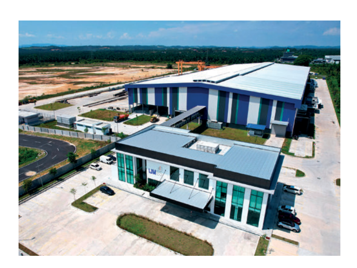
IJM IBS produces advanced precast products with Progress Group's automated machinery in Bestari Jaya, Selangor, Malaysia.

The precast concrete market, driven by factors such as increased demand for affordable housing, urbanization, environmental concerns, and technological advancements, offers a diverse range of products. IJM IBS plays a key role in this landscape, offering a wide array of elements, including columns, beams, slabs (BubbleDeck/half slab/full slab), plain wall panel, customizable patterned wall panels, toilet pan, staircase, architectural elements and more. These precast elements enable faster, safer, and more efficient construction with reduced waste.