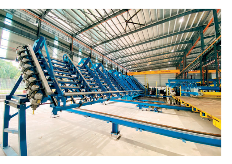
The M-System Evolution is an advanced mesh welding plant that produces customized reinforcement mesh for precast elements.