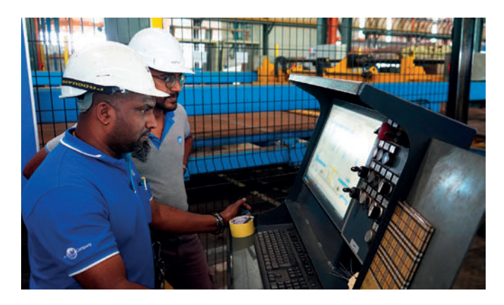
With the 3D carrousel plant visualization, integrated in ebos, IJM has always an eye on production control and analysis.