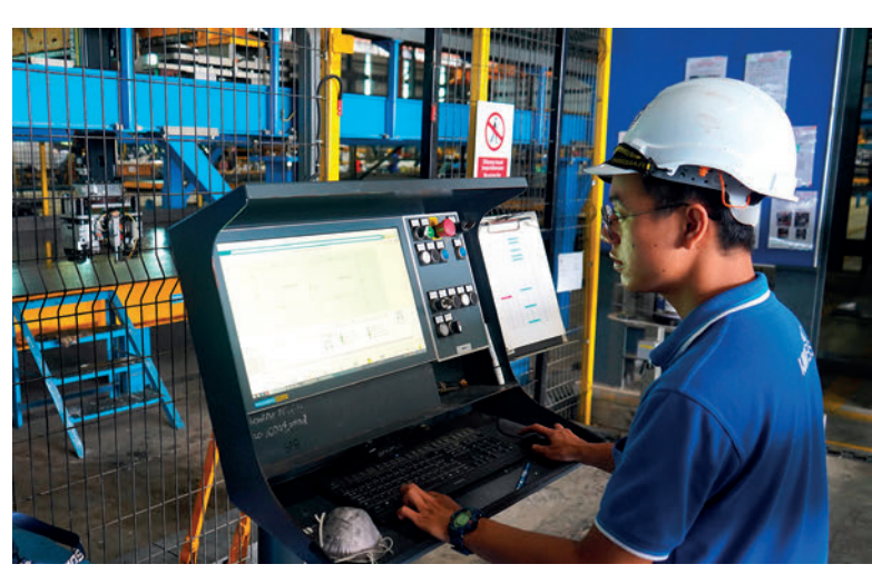
ebos software: Streamlining the manufacturing process from start to finish.