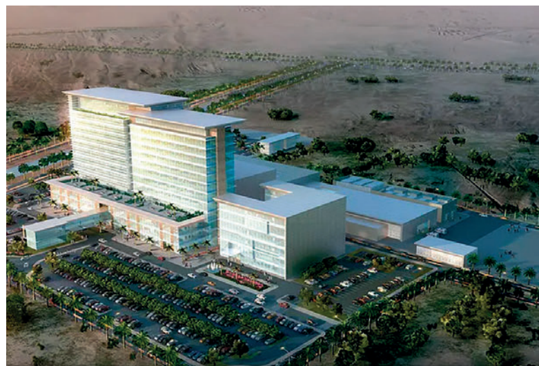
Karbala University Hospital is for the benefit of the Ministry of Higher Education and Scientific Research in the holy governorate of Karbala.