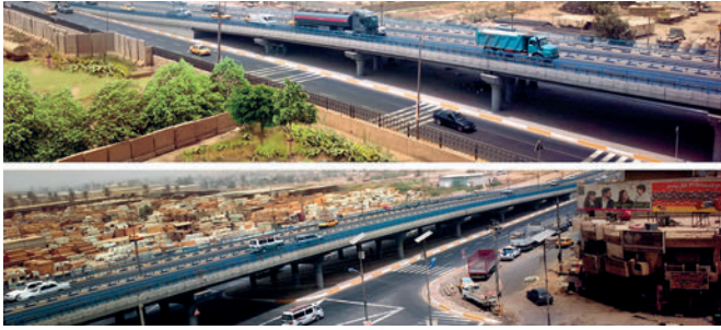
Shaab District Overfly Bridge. The bridge has four lanes, and half a kilometer long.