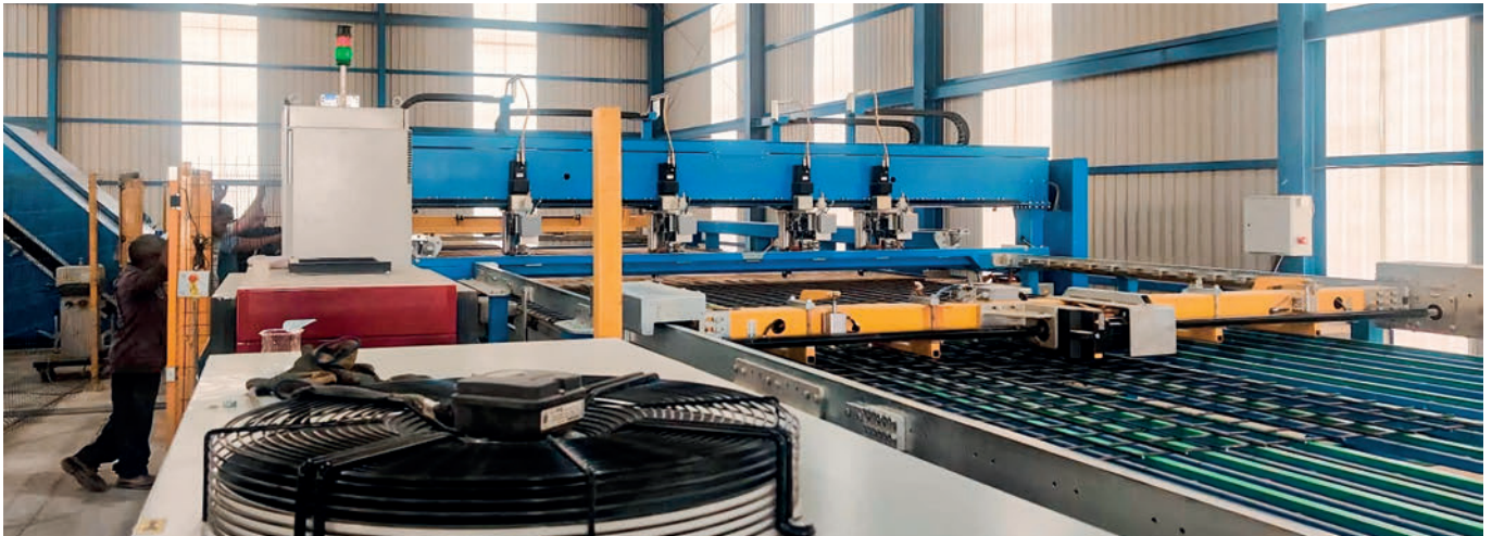
The M-System BlueMesh is automatically welding the bespoke mesh according to plan with 4 flexible welding heads.