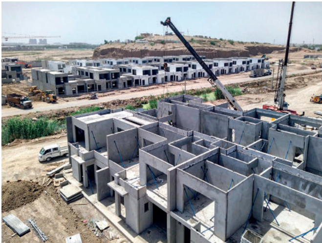
The Lake city project near Baghdad Airport comprises 1,466 villas as well as 26 of Fifteen-floor high rise buildings.

Progress Group to obtain their goal of saving time without compromising on quality. The tailor-made mesh for critical architectural and structural design can now be produced fully automated. This improves the production process and makes it possible to deliver within the deadlines. The machinery is easy to operate, the software feature is integrated, and the precision of the performance is remarkable according to the responsible at Fourth Dimension. With the "stabos" software solution integrated in the machinery the collection and evaluation of production data can be done automatically. With the centrally collected data, the productivity and the quality of the plant has been additionally increased.