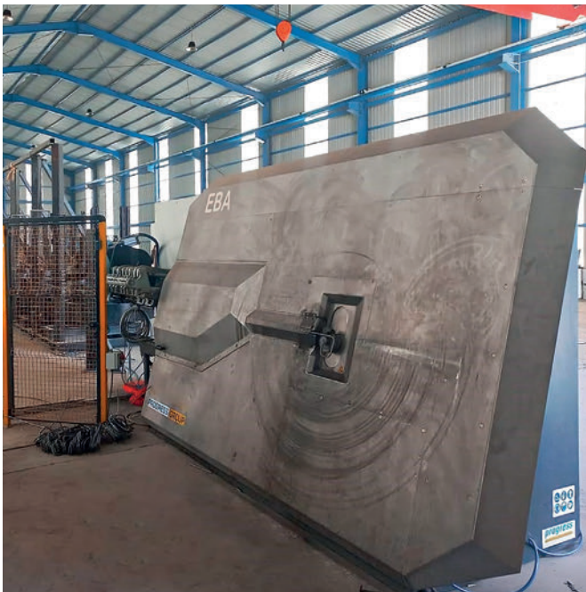
The EBA stirrup bender is providing a just-in-time production of stirrups from coil.

Progress Software Development GmbH Julius-Durst-Straße 100, 39042 Brixen, Italy T + 39 0472 979159 info@progress-psd.com , www.progress-psd.com