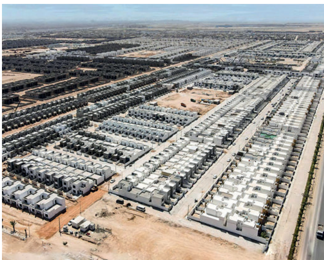
Al Ghadeer 1 village with 3,200 houses & Al Ghadeer 2 Village with 1,200 houses which was commissioned by the Al-Najaf Al-Ashraf Investment Commission in response to the increasing demand for affordable housing.

Fourth Dimension Precast invested in a new M-System Blue-Mesh® mesh welding plant and an EBA stirrup bender from