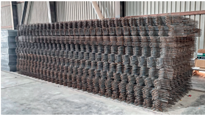
The flexible tailor-made reinforcement for the precast elements can be produced fully automated with the new machinery.

Fourth Dimension Precast is a subsidiary of Fourth Dimension Group and is the leading Baghdad (Iraq) based group focused on building material and construction related industries. Fourth Dimension Precast has been manufacturing precast products since 2002.