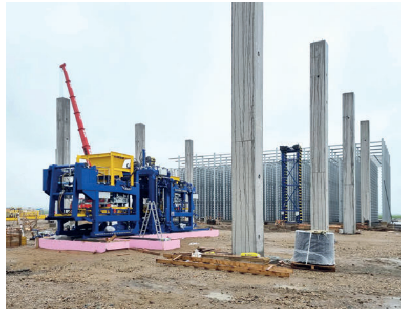
Early stage of construction: Step by step, the new high-tech plant is being installed around the Masa XL-R.

ity and refined products. The know-how and equipment come mainly from Masa. The integration of equipment from other suppliers (e.g. dosing plant and parts of the mixing plant or the surface treatment line, which is to be further expanded in the summer of 2023) was and is carried out in close dialogue