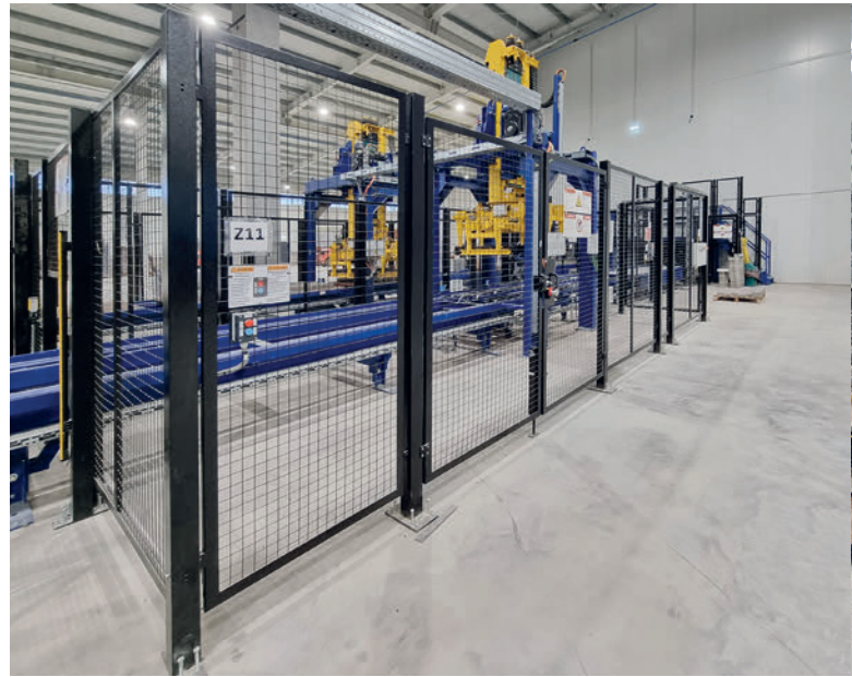
The centring devices I and II on the two parallel-guided return transports prepare the cured products on the production board for cubing by loosening and centring the product layer.

After curing, the Masa finger car automatically transfers the full production boards to the respective intermediate finger car of line I or II. With a sophisticated system, the automated transport of the products to the cubing area (or to the later finishing line) now takes place. Masa left nothing to chance on this line either and planned in various components that either provide room for very flexible quality assurance or support the cubing process in advance. By designing the return transports as a V-belt conveyor system in combination with a walking beam conveyor, the Masa engineers and designers took Elis Pavaje's pronounced quality requirements into account: Due to its mode of operation, the V-belt conveyor system offers a convenient time buffer for detailed quality control without interrupting the entire transport process towards the cubing and thus risking a loss of cycle time.