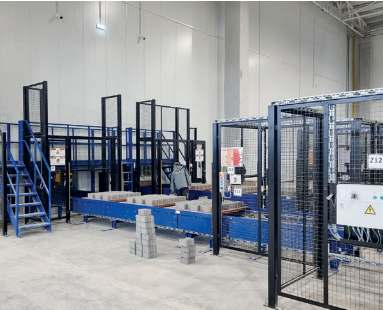
Safety first: Masa designed the plant in such a way that Elis Pavaje can always carry out safe quality checks with consistent cycle times.