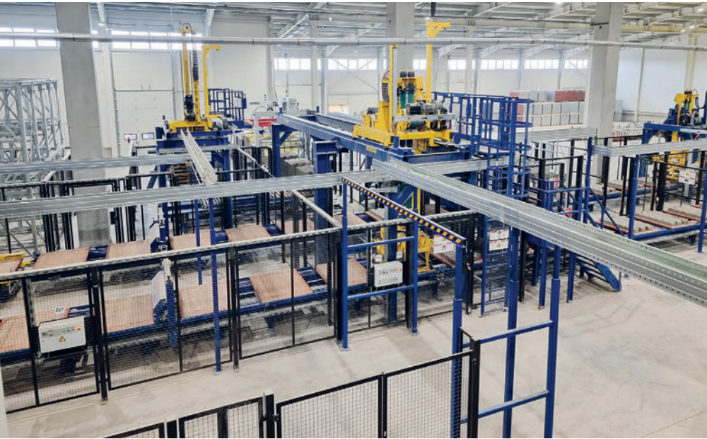
Complex plant with Masa technology: Dry side with two return transports, Cuboter, transport pallet grab and feeding systems for the empty production boards. As a complete supplier, Masa also provides the cable trays.

functions are available for this purpose. The Masa transport pallet grab handles the automated feeding of the transport pallets required for cubing. The transport pallets are stored in a large buffer (3 stacks).