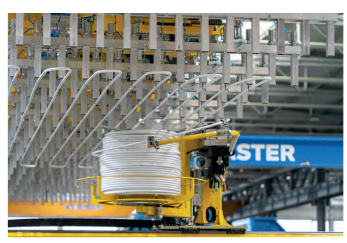
The Tube Master was specially developed by the Progress Group for bending and installation of tubes within precast concrete element production.

little necessary rework, such as securing the pipe to the pallet, and therefore allows for faster process speeds with reduced labour costs. Through simulation, the product can be tested even before the start of production and, if necessary, it can be adjusted and waste can be avoided. The precast concrete elements equipped with it are more energy-efficient, have a high thermal capacity and, due to their size, manage with very low flow temperatures.