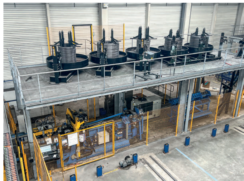
The lattice girder welding machine Versa was installed under the coils to save space and can produce the lattice girders just-in-time.