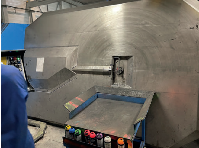
The Pluristar is an automatic stirrup bender, straightener, and double-bending machine in one.

CAD data. This saves time, avoids errors and hence waste.