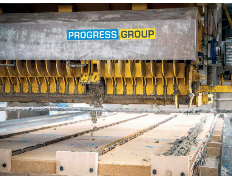
The concrete spreader works exactly with the calculated quantities and therefore saves concrete.