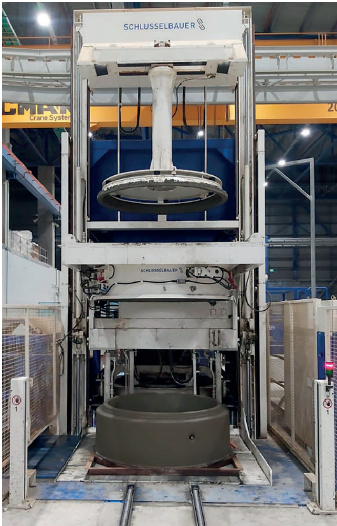
The Magic system for mass production of manhole risers with nominal widths of 800, 1000, 1250 and 1500 mm.

This new production technology means Sela now has the most modern manhole component plant in the entire Mediterranean area in terms of production capacity and component quality. This represents a key step in the company's evolution within the country, in terms of its growth and potential for further development in the coming decades.