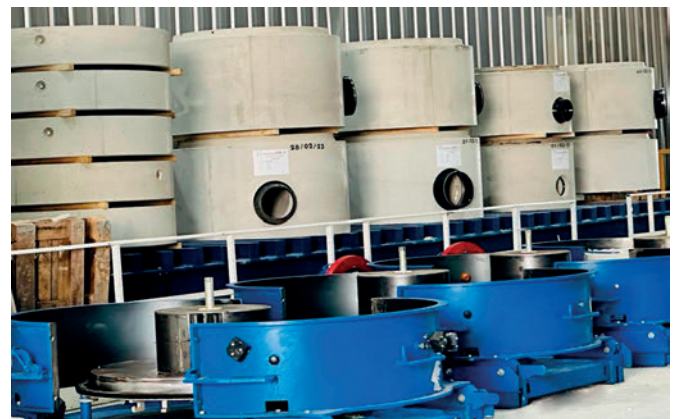
The hydraulic turning gripper is used to demould Perfect manhole bases from the moulds and turn them into the installation position.

gasket. The channel negative that is produced in just a few steps is then placed in the casting mould and attached to the outer moulds using magnets. A release agent applied by sponge is equally suitable for all parts and materials—gaskets, EPS channels, steel mould—and also contributes to the surface quality of the finished manhole component.