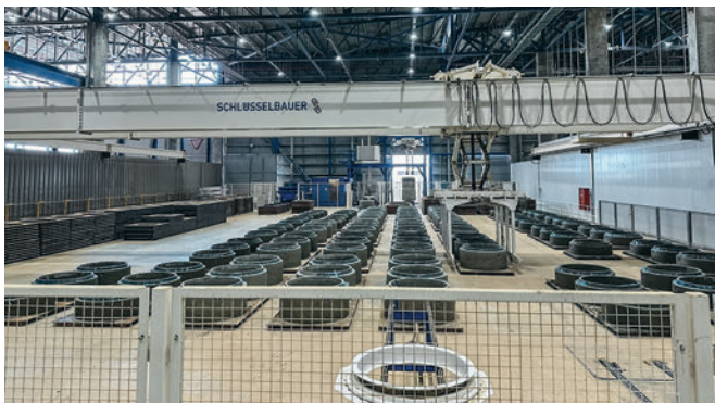
The curing area for standardized manhole risers with the Transexact automatic crane.

This new production technology means Sela now has the most modern manhole component plant in the entire Mediterranean area in terms of production capacity and component quality. This represents a key step in the company's evolution within the country, in terms of its growth and potential for further development in the coming decades.