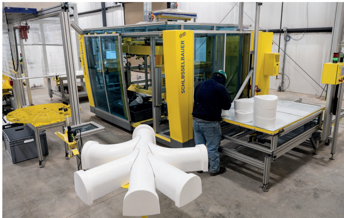
Production of a channel negative on the Perfect system; the image shows the complete channel with multiple pipe connections.

The Naot Hovav site is located around 60 miles southwest of Jerusalem and represents a milestone in Sela’s evolution as a company. A large redevelopment area provided the ideal conditions for production and storage, for which space was simply too limited at the existing site in Ashkelon. The collaboration between Sela and Schlüsselbauer Technology had a