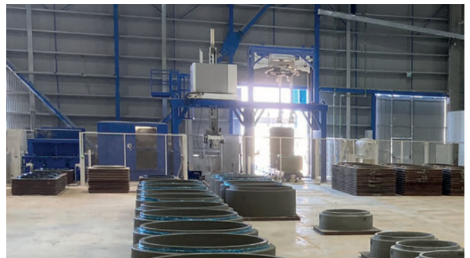
As well as the actual production, the palletizing of the products, and the cleaning and oiling of the pallets are all fully automated.

Schlüsselbauer Technology GmbH & Co. KG Hörbach 4, 4673 Gaspoltshofen, Austria T +43 7735 71440 sbm@sbm.at , www.sbm.at