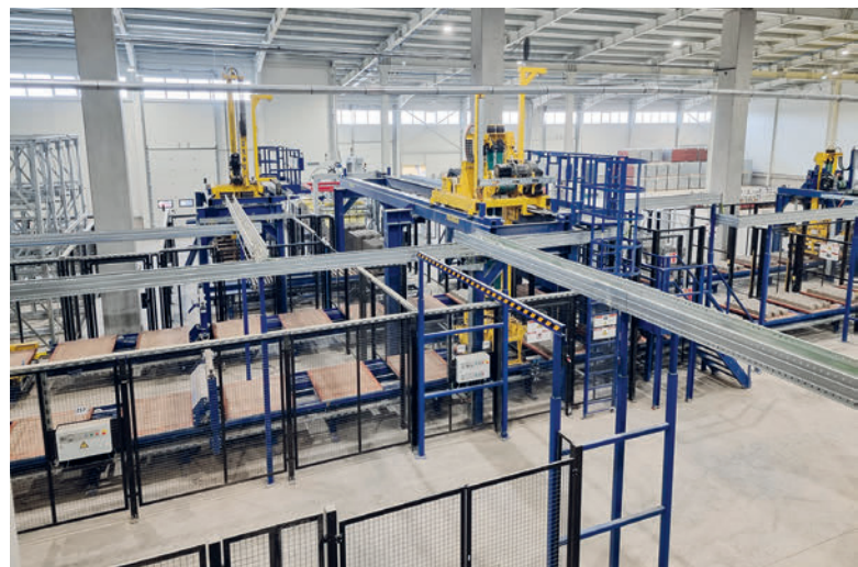
Complex plant with Masa technology: Dry side with two return transports, Cuboter, transport pallet grab and feeding systems for the empty production boards. As a complete supplier, Masa also provides the cable trays.