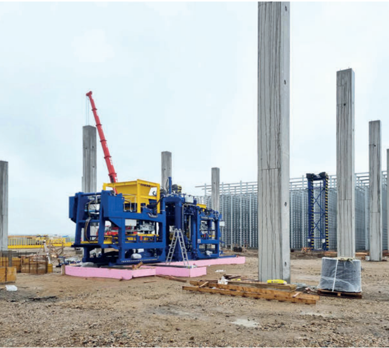
Early stage of construction: Step by step, the new high-tech plant is being installed around the Masa XL-R.

The plant in Arad is particularly important for the company because, in addition to its very large production capacity, it also opens up the possibility for innovations with which Elis Pavaje can once again expand its leading role on the Romanian market as well as open up new markets. The company's general offer naturally includes all kinds of standard products such as pavers, slabs, kerbstones, prefabricated concrete elements for fences and walls as well as drainage elements. With the new plant, it is now also possible in Arad to develop and produce products with special surfaces and eventually introduce new models from the premium range. The plant started production on schedule at the end of 2022.