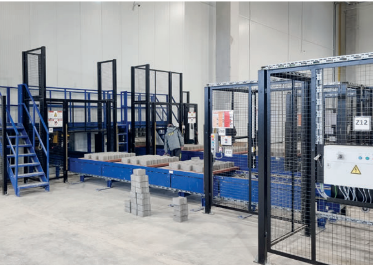
Safety first: Masa designed the plant in such a way that Elis Pavaje can always carry out safe quality checks with consistent cycle times.