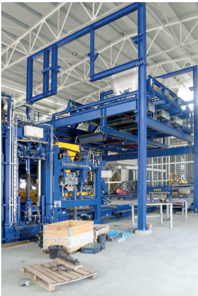
The assembly of the actual heart of the production plant, the Masa XL-R with Multi colour system (here for face mix concrete) required some routine and sensitivity.

Emil and Vasile Goța have high expectations of a block making machine. It has to be efficient and reliable, no question. But that in itself is not enough to be able to manufacture innovative products. With the XL-R product line, Masa created a Premium Line a few years ago that is the answer to the requirements of premium manufacturers of concrete products. The machine is equipped with plenty of product and cycle