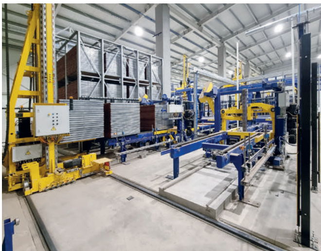
The Masa transport car reliably stores and retrieves the empty production boards in and out of the storage rack.

A modern production plant requires an intuitive and above all reliable plant control system. For uniform operation and visualisation of the components, Masa offers its own modular software in three expansion stages, whereby the Basic version already includes various tools for visualisation, prod-