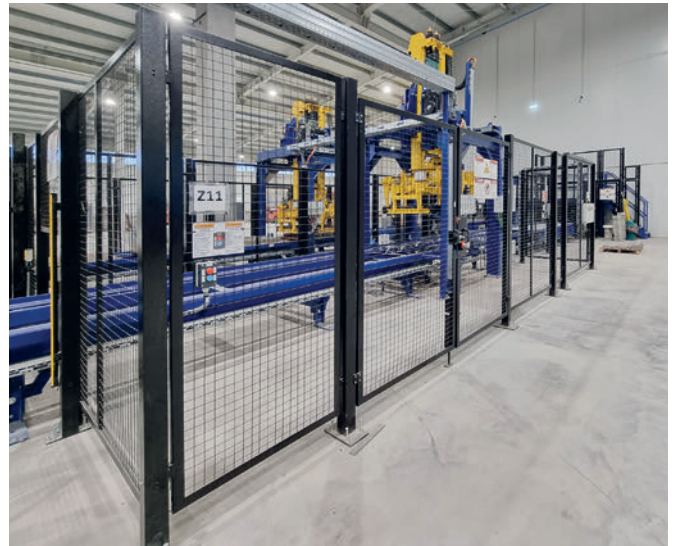
The centring devices I and II on the two parallel-guided return transports prepare the cured products on the production board for cubing by loosening and centring the product layer.

diate storage of production boards. In Arad, the intermediate storage of production boards was essential because the plant design included two return transports. Here, the two-part storage rack now offers the possibility of temporarily storing up to 2400 empty production boards, either from dry line I or II. It is worth mentioning the very good cooperation with the Rotho company, which supplied both the storage rack and the curing racks with circulating air system here.