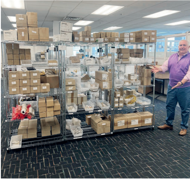
Spare parts warehouse in Philadelphia

in Lindern, Lower Saxony. This helps to avoid long delivery times for electrical and also mechanical components and to offer an even faster and more efficient service. Kraft Curing Systems has made it its business to deal with its customers' problems within 24 hours. The customer is guaranteed fast delivery of spare parts and on-site support - regardless of the country in which the plant is located. True to the motto: Nothing is impossible. Every problem can be solved and there are individual and quick solutions for all of them. First and foremost, the client should be supported, costs and efforts should not be a priority.