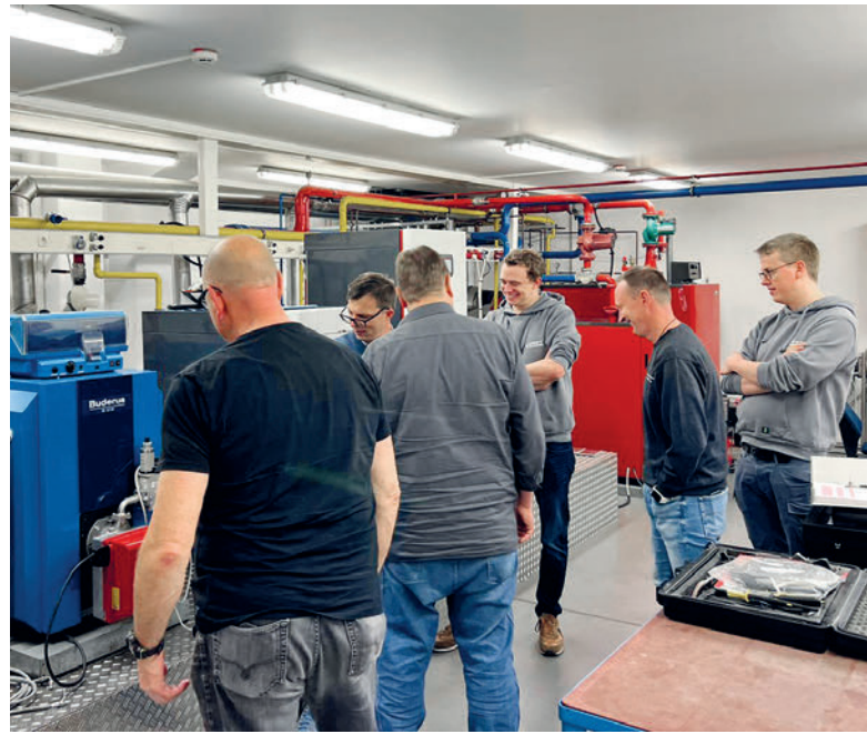
Kraft Curing always offers its employees training, further education and workshops.

Whether the technician travels by service truck or by plane is irrelevant. Because every maintenance includes the components that the technician carries along or that are sent in advance. Efficient and successful maintenance always requires the right spare parts and tools.