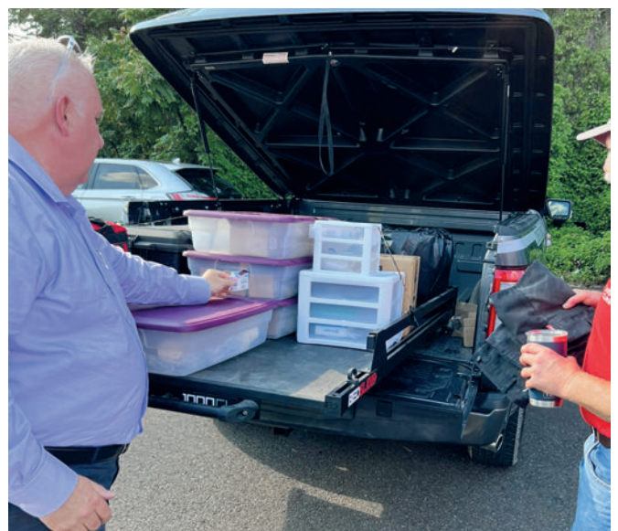
The service vehicles are equipped with spare parts, tools and measuring instruments.