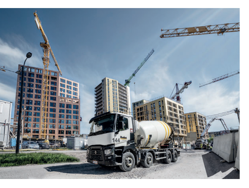
Rudus made the important step to digitalize with Progress Software Development to stay ahead in every process of production and building.

"Thanks to e<sup>p</sup>bos, we have been able to develop more transparent and aligned business processes inside the company