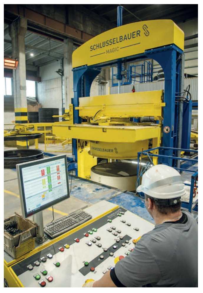
In order to ensure the fresh product is demoulded carefully, the mould and the press unit are raised in cycles.

At the time of start-up, the new Magic 2500 at Tiba Austria GmbH was used to manufacture manhole risers and cones with the nominal widths DN 2000 and DN 2500. The manhole risers are available smooth or with built-in sleeves for step rungs to be installed later on. There is also a version with perforated manhole risers for soakaway applications. The maximum construction height of the manhole risers of both nominal widths is 1000 mm. The construction heights of the cones are 800 mm for the nominal width DN 2000 and 900 mm for DN 2500. Just like the manhole riser moulds, both cone moulds are equipped with hydraulic reinforcement ring centering. This not only ensures that the reinforcement ring is precisely positioned in the product, it also makes the rings easier to insert. For secure and space-saving storage, both cones are shaped to fit the external contour with different sized stacking lugs.