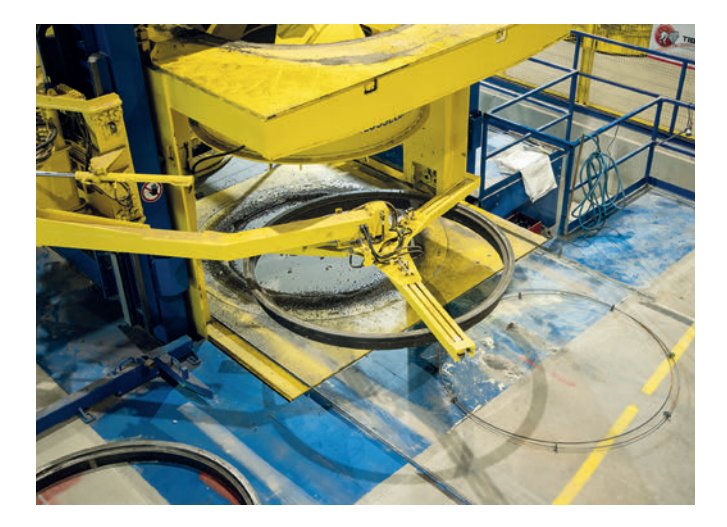
A steel bottom pallet is automatically transferred to the machine for each production cycle.

vibration cycles and frequencies, and acceleration values are stored in the machine program for each product. This means that the operator can access all the necessary product settings at the push of a button right from the start, even after the product – and therefore the mould – have been changed.