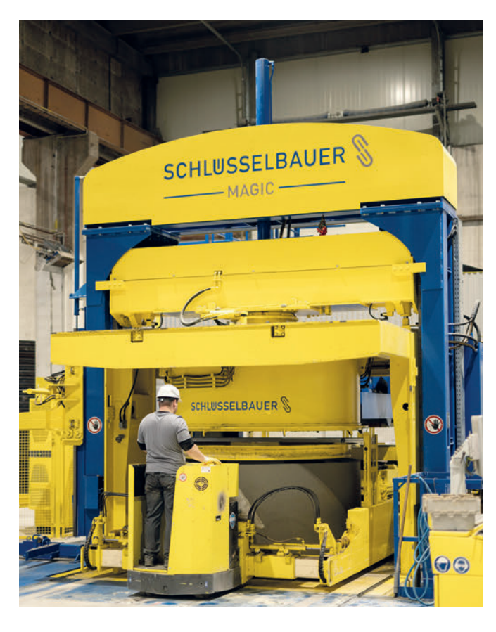
The installation of the Magic 2500 is a milestone in the site upgrade work at Tiba Austria GmbH in the Greater Vienna area.

This also applies for the quick-change mould system, which enables the machine to be converted in under an hour. Thanks to the high level of flexibility provided by the Magic series, Tiba Austria GmbH will also be able to easily manufacture other products on this machine in the future if need be.