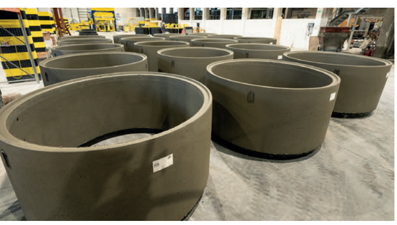
Up to 110 DN 2000 manhole rings or 90 DN 2500 manhole rings are manufactured in one-man operation at the Sollenau site every day.