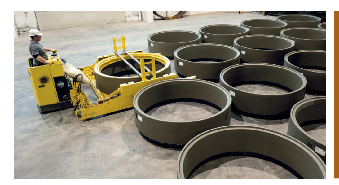
Fresh products are carefully transported to the curing area using an electrical cart for transportation and a set ring manipulator.

Fresh products are transported from the machine to the curing area by a worker using an electrical cart. To protect the manhole riser joint, a set ring mounted on the electrical cart for transportation is placed on the fresh product and removed again in the curing section once the product has been set down; this can be done without the assistance of another worker. Once the products have been delivered to the exter-