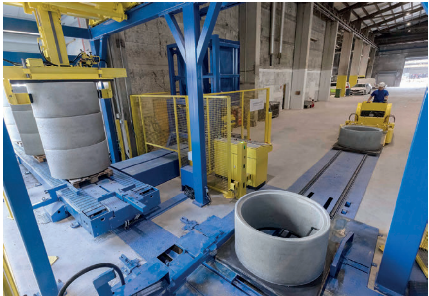
Manhole rings up to DN1500 are produced on the Magic 1501, first installed in 2021, as reported in detail in CPI 01/2022.