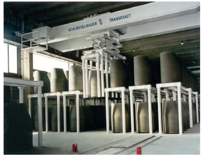
Signs of a successful long-term partnership: Perfect manhole base production system installed in 2014, Exact manhole cone production system installed in 1998.

The longevity and reliability of Schlüsselbauer Technology's machines is plain to see at the plant in Sollenau. Back in 1998, a previous Maba Group company installed a fully automated Exact manhole component production system at the same site. To this day, manhole rings and cones up to a construction height of 2100 mm are manufactured in one-man operation on a daily basis. The entire handling process for the fresh and cured products is fully automated and is carried out using a Transexact crane robot and a connected pallet management system, including cleaning, oiling, and storage. In 2014, after the site was taken over by Tiba Austria GmbH, a Perfect monolithic concrete manhole base production system was installed, followed by the Magic 1501 manhole ring system mentioned above. Tiba Austria GmbH currently employs 150 people at five production sites for precast concrete parts in Austria and generates an annual turnover of approx. 38 million euros.